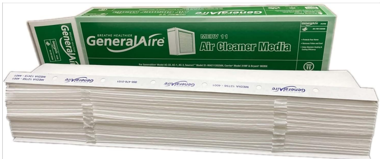
Image 3.1: GeneralAire 12758 MERV 11 Air Filter, showing the pleated media fully expanded.

The GeneralAire 12758 filter is shipped in a collapsed, accordion-like state and must be expanded into your existing air cleaner frame. This process requires careful attention to ensure proper fit and function.