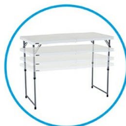
ADJUSTABLE HEIGHT 22", 24", 29", 36"