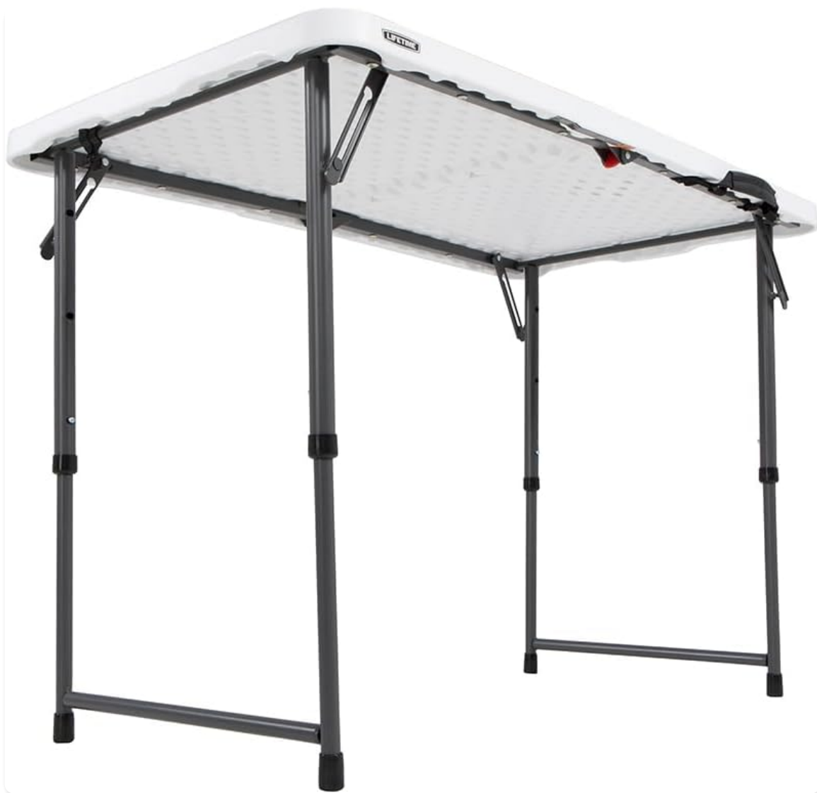
Figure 4: The underside of the table, illustrating the leg structure and how they fold and lock.

Your browser does not support the video tag.