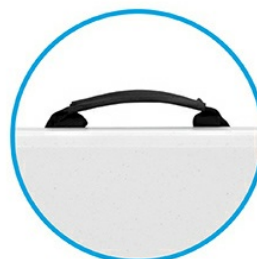
CARRY HANDLE QUALITY COMFORT