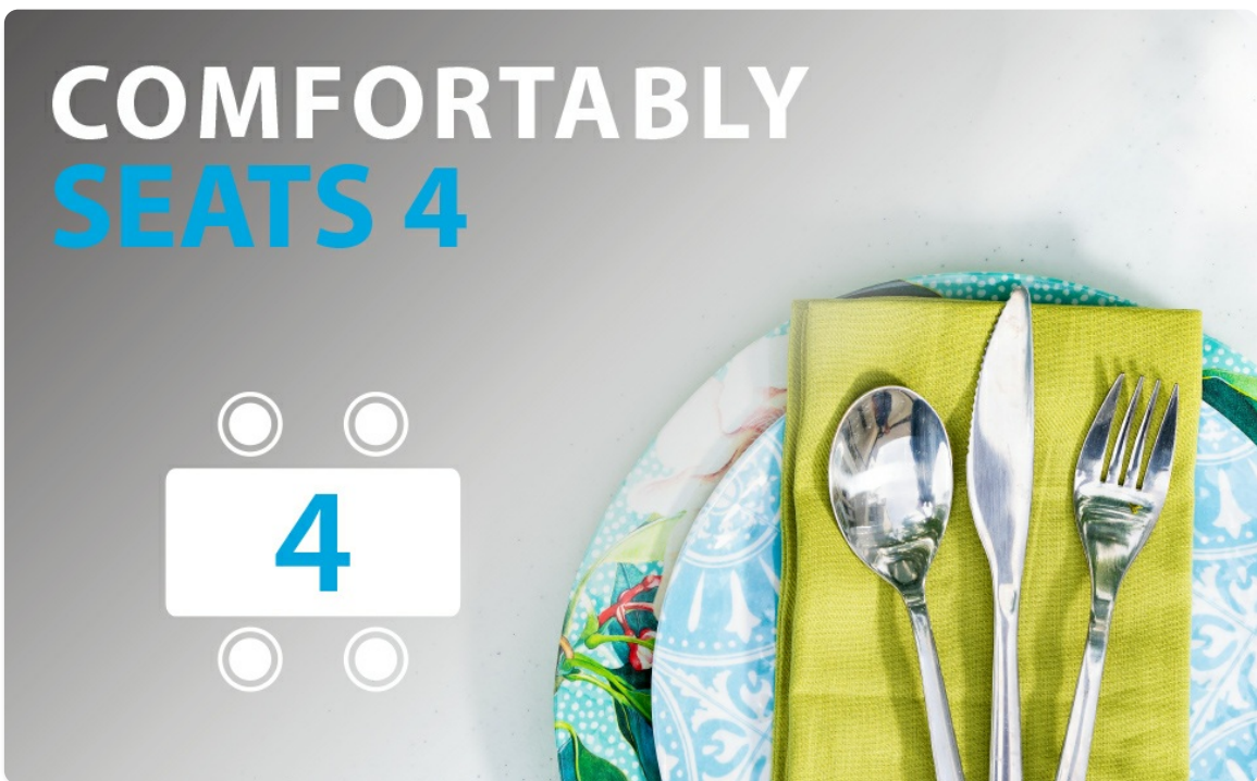
Figure 7: The table's seating capacity, indicating it can comfortably accommodate four people.