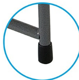
FOOT CAPS PROTECT YOUR FLOOR