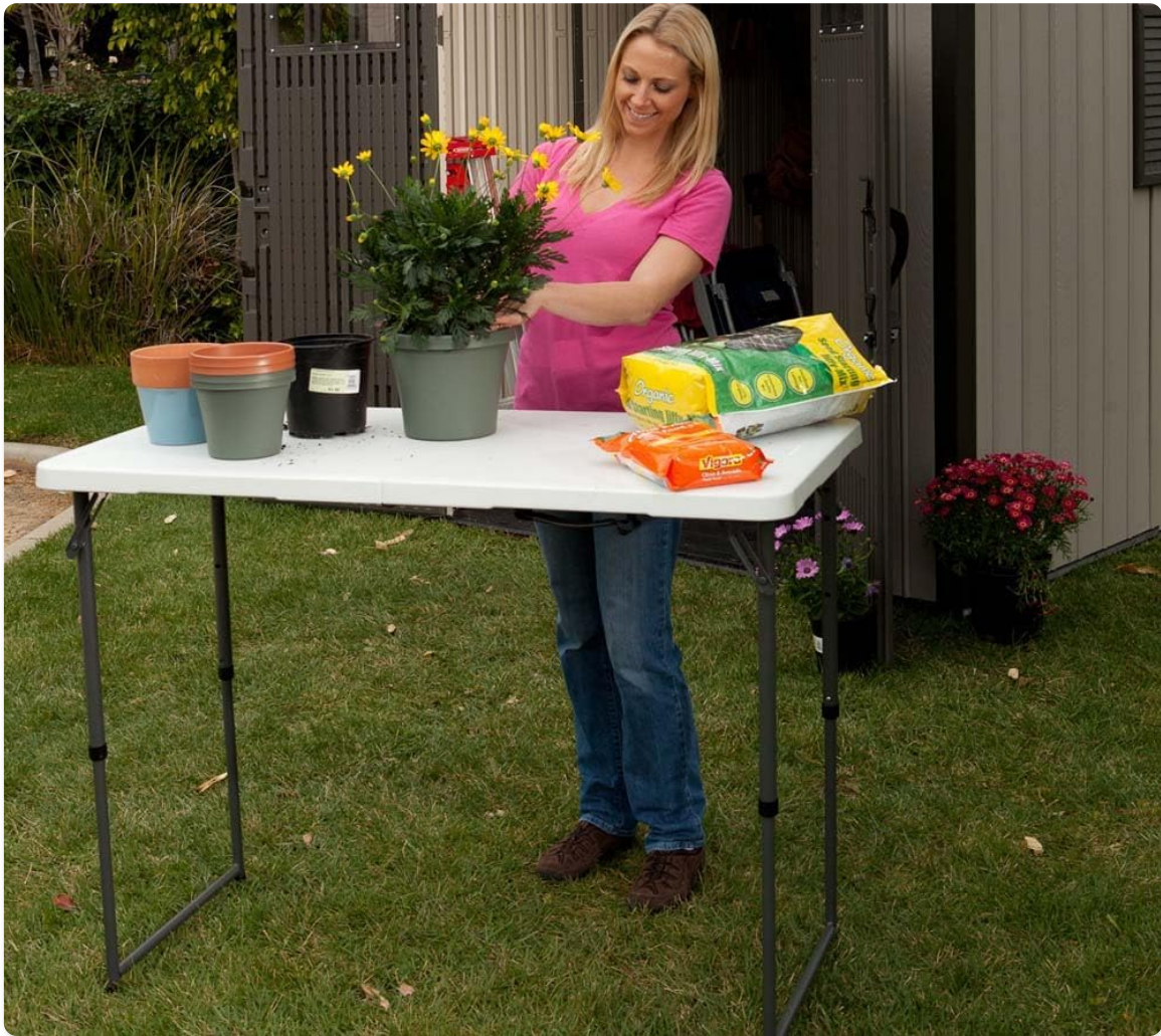
Figure 6: The table in use for outdoor activities, demonstrating its practical application.