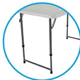
BROAD LEG STANCE STURDY AND STRONG