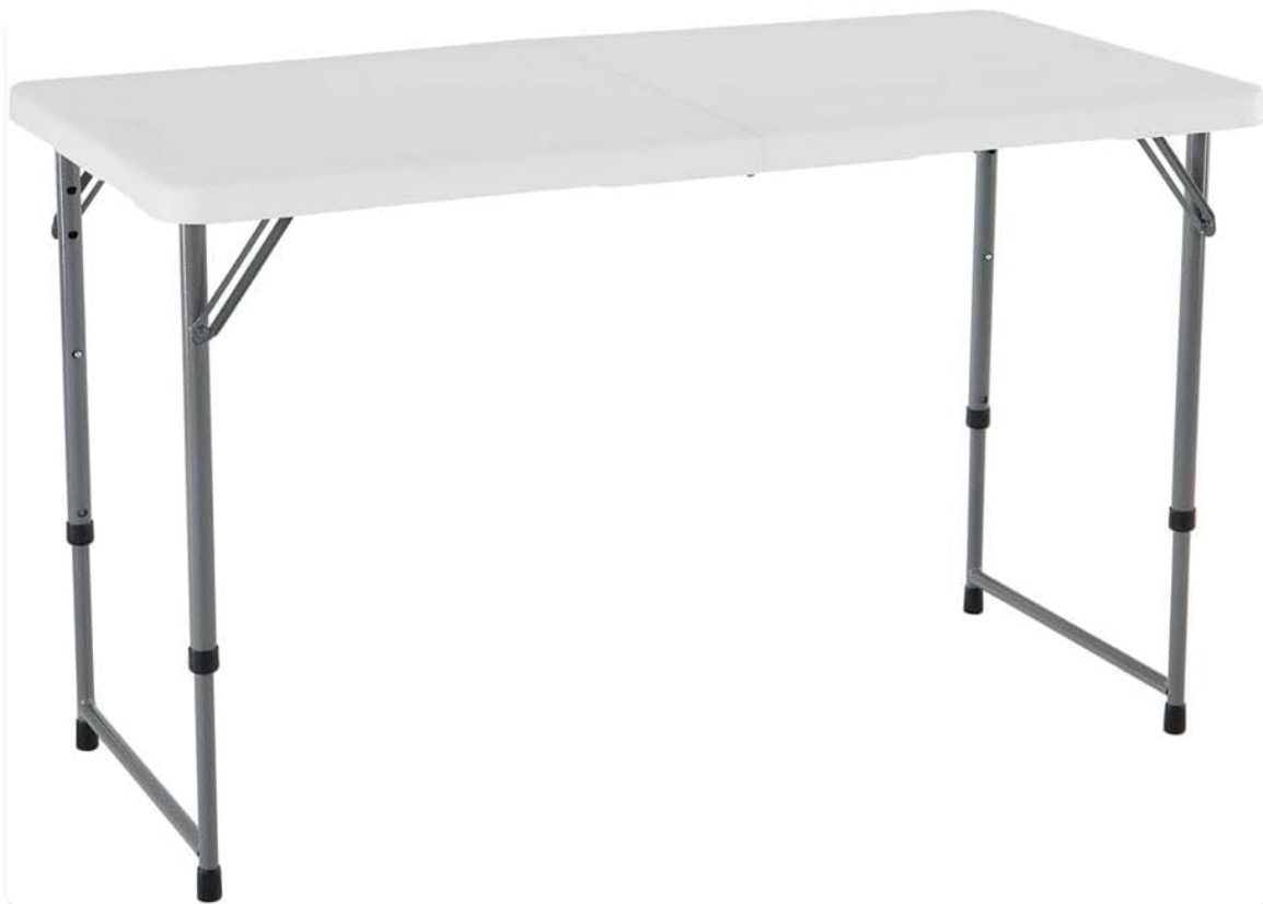
Figure 1: The LIFETIME 4-Foot Fold-in-Half Adjustable Folding Table in its fully extended position.