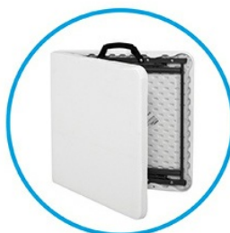
FOLDS IN HALF COMPACT AND PORTABLE