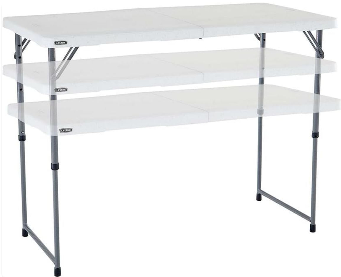
Figure 5: The table adjusted to its highest setting, suitable for standing tasks.