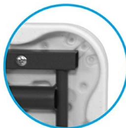
DURABLE CORNERS IMPACT RESISTANT