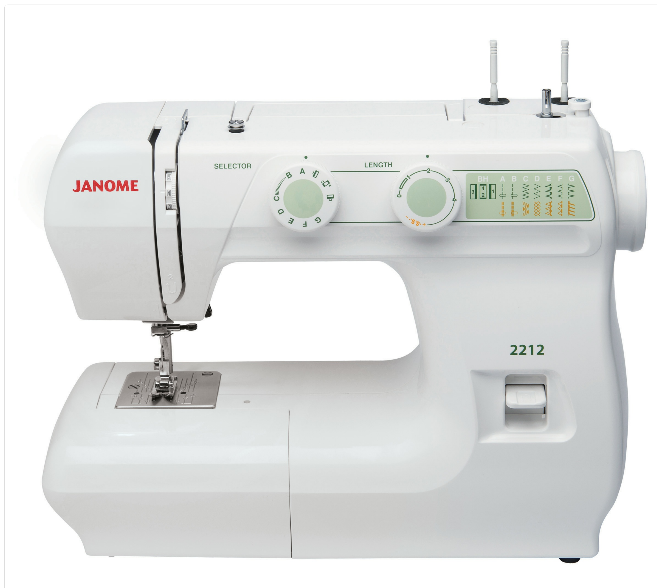
Figure 2: Spool pins and bobbin winder on the Janome 2212.

The Janome 2212 features a convenient push-pull bobbin winder. Place an empty bobbin onto the bobbin winder spindle. Guide the thread from your spool through the tension disc for bobbin winding and then around the bobbin. Push the spindle to the right to engage the winder, and gently press the foot pedal to begin winding. Stop when the bobbin is full, then push the spindle back to the left and trim the thread.