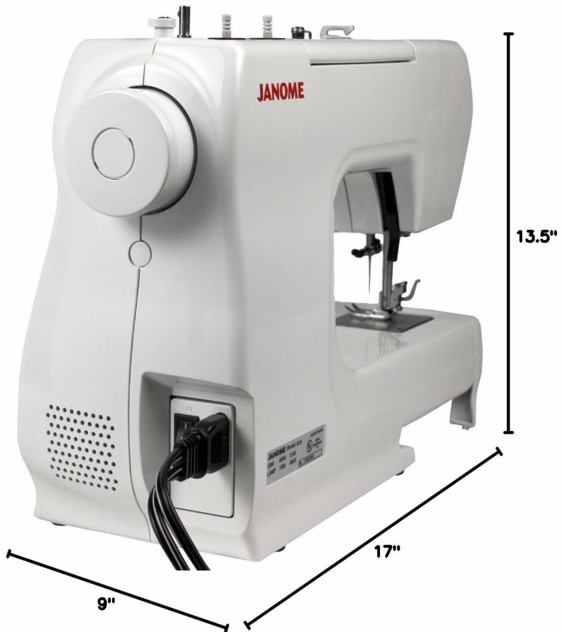
Figure 3: Dimensions of the Janome 2212 Sewing Machine.