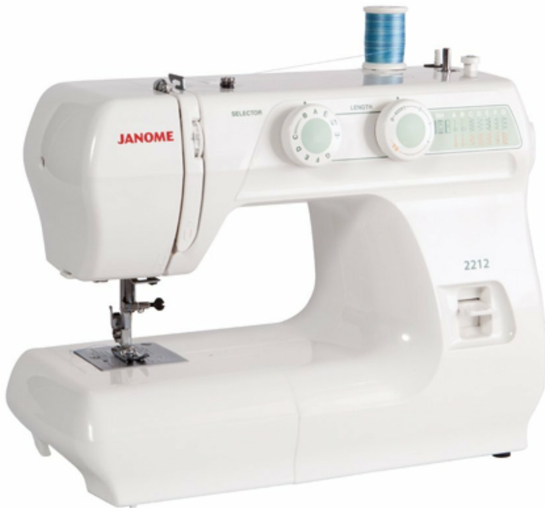
Figure 1: Front view of the Janome 2212 Sewing Machine.