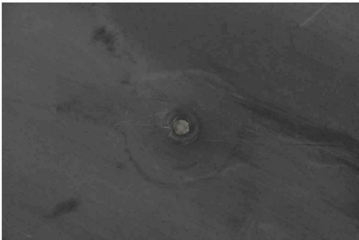
Figure 4: A small drainage hole located at the base of the fire pit bowl, designed to prevent water buildup.