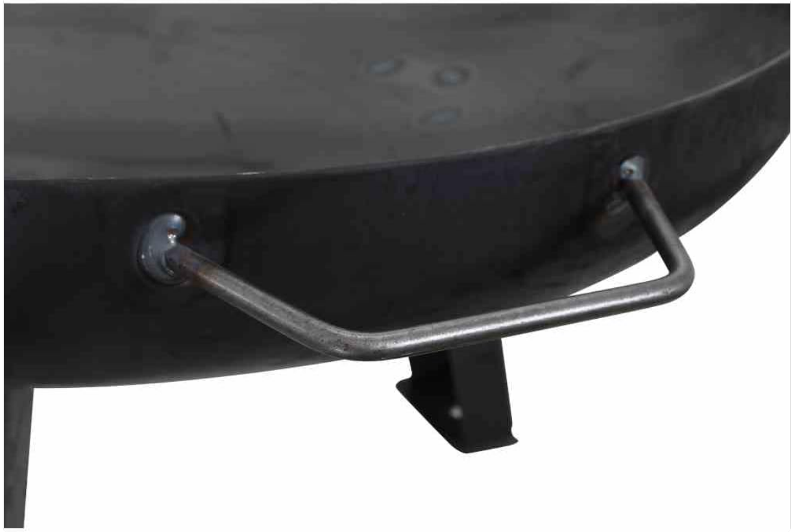
Figure 2: Detail of a sturdy metal handle integrated into the fire pit's bowl, designed for safe handling when cool.