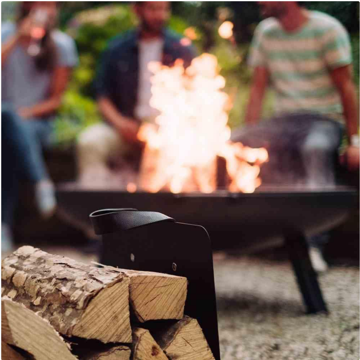
Figure 3: The Siena Garden Antico Fire Pit fully assembled and ready for use in an outdoor setting.