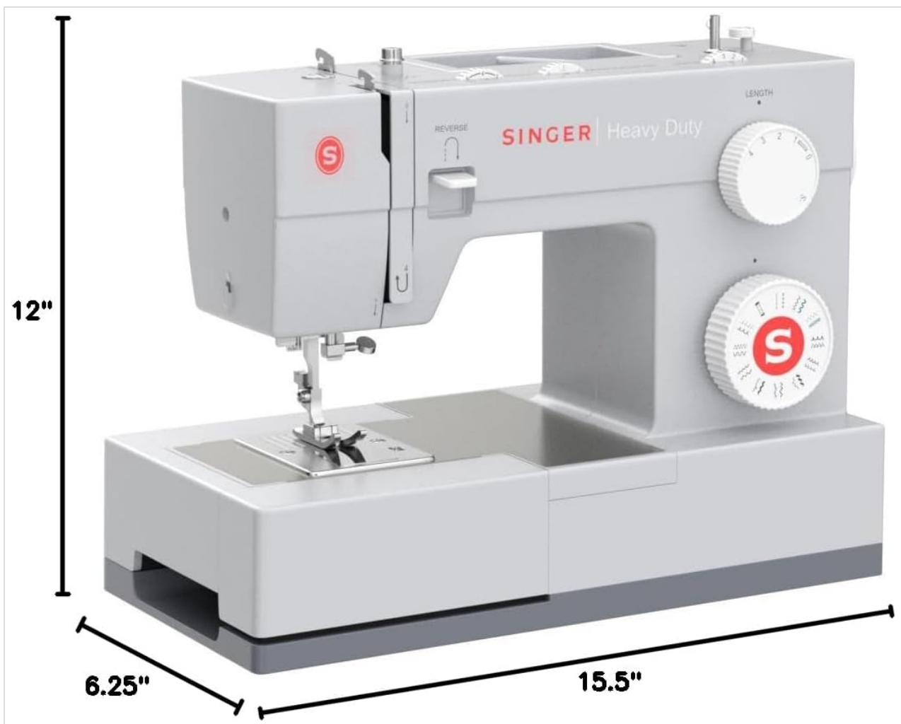
Figure 7.1: SINGER Heavy Duty 4423 Dimensions. This image provides a visual representation of the machine's physical dimensions.