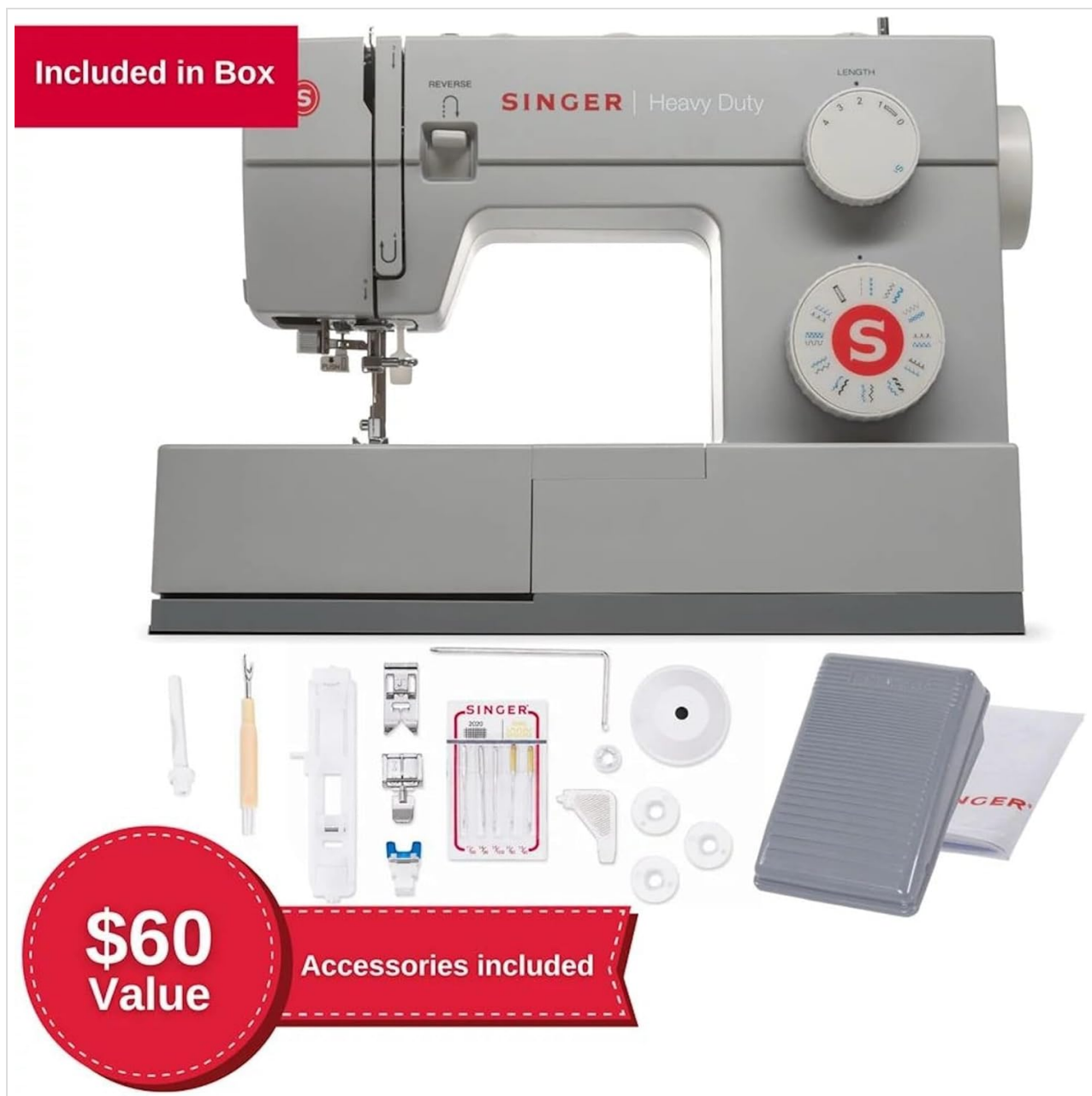
Figure 4.1: Included Accessory Kit. This image displays the various accessories that come with the sewing machine, including different presser feet, needles, and bobbins.