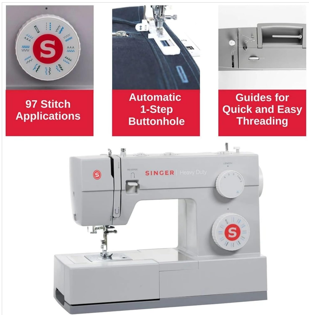
Figure 3.1: 97 Stitch Applications. This image displays the stitch selection dial with various stitch patterns available.