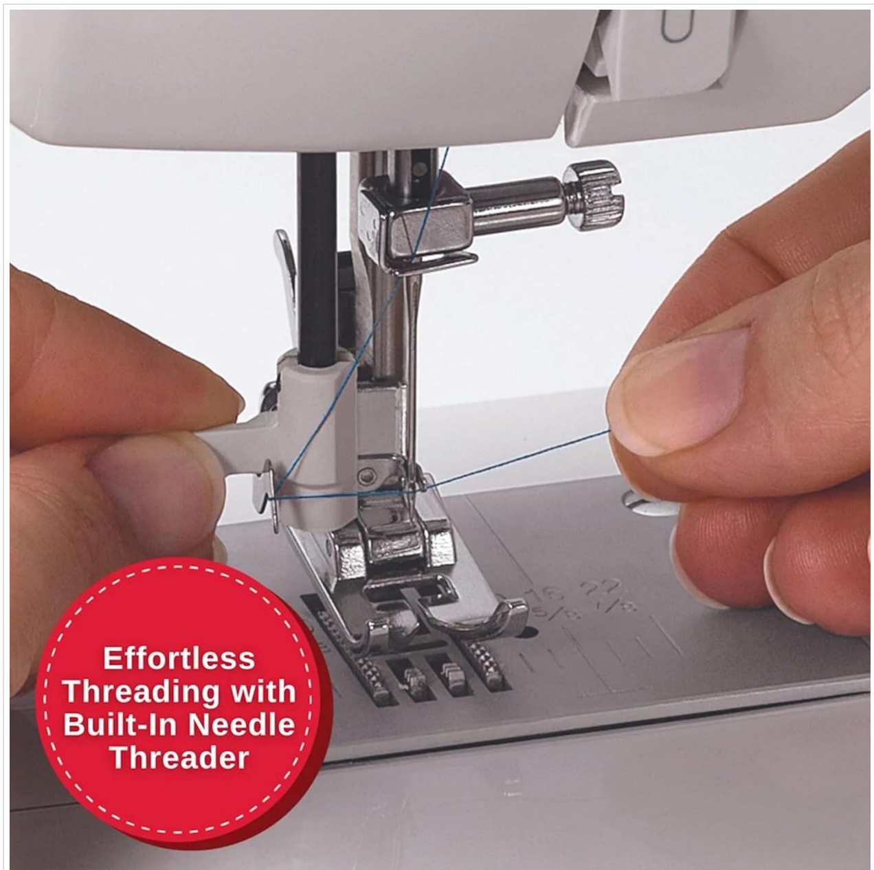
Figure 2.1: Effortless Threading with Built-In Needle Threader. This image demonstrates the use of the automatic needle threader for quick and easy setup.

The SINGER 4423 features an automatic needle threader to simplify the threading process. Follow the numbered threading path printed on the machine, then use the built-in threader to effortlessly thread the eye of the needle.