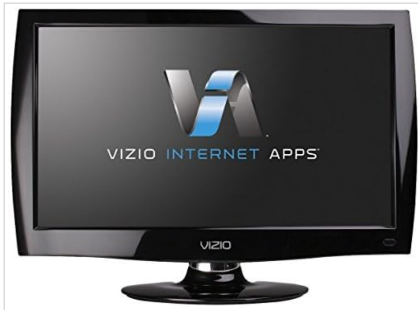
Figure 1: Front view of the VIZIO M221NV 22-inch LED LCD TV, featuring a black bezel and stand. The screen displays the 'VIZIO INTERNET APPS' logo, highlighting its smart TV capabilities.