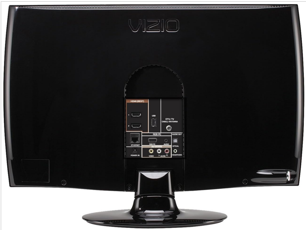
Figure 4: A detailed close-up of the VIZIO M221NV TV's connection panel, clearly labeling each port such as HDMI (1 and 2), USB, DTV/TV (Cable/Antenna), Ethernet, Power In, RGB PC, Audio (L/R), Video, Optical Audio Out, and Headphone. This helps users identify the correct ports for their devices.