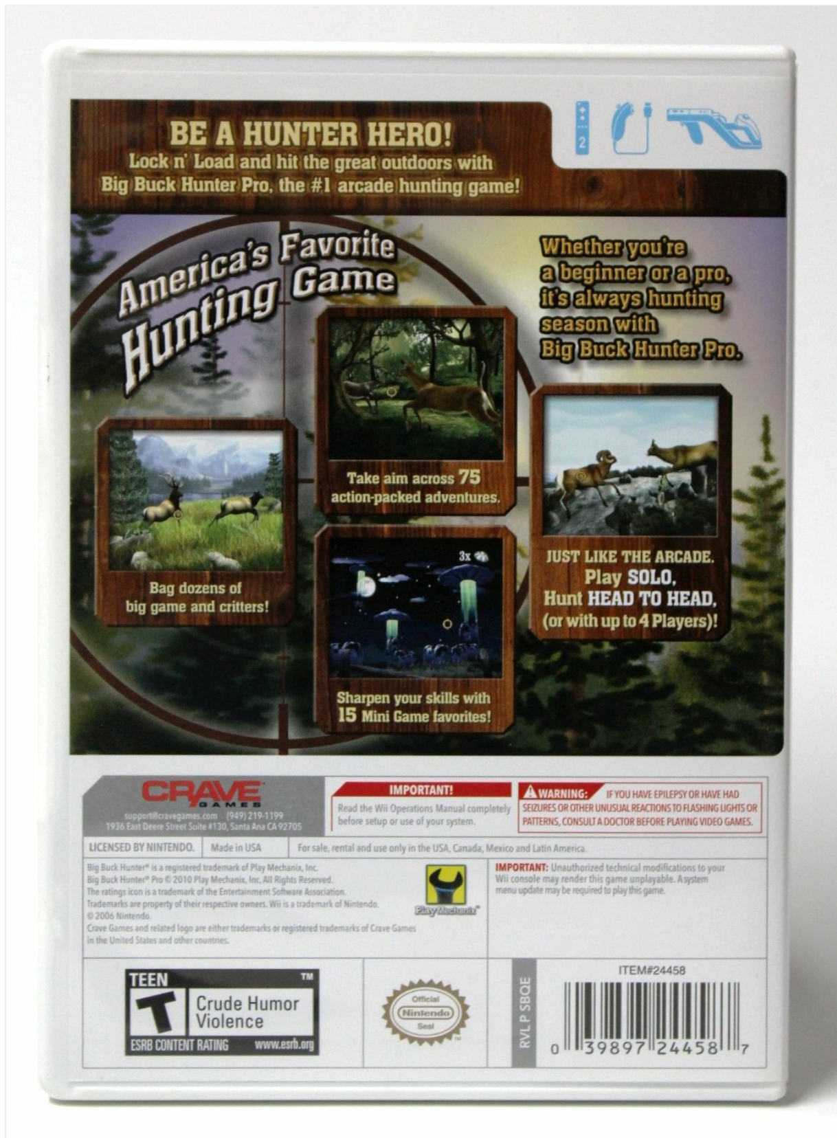
Figure 3: Back of game box with gameplay screenshots.