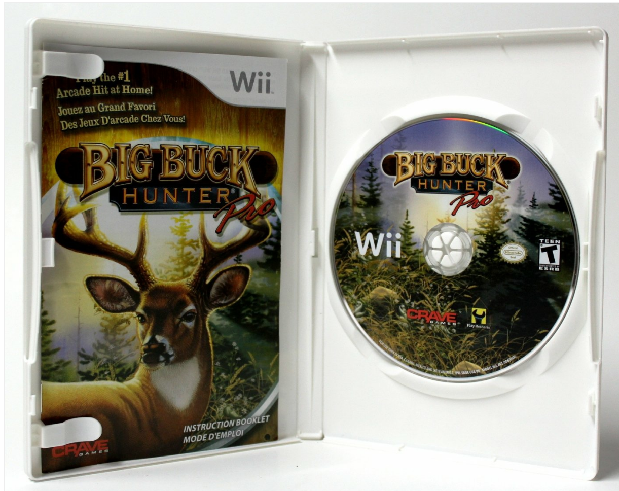
Figure 2: Game disc and instruction booklet.