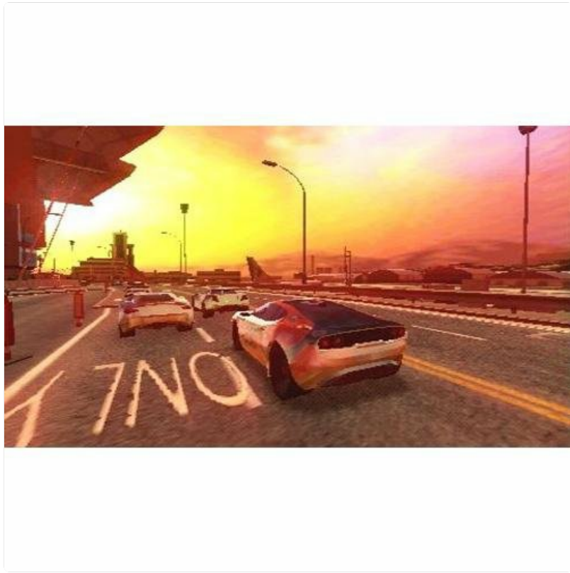
Figure 3.1: An in-game screenshot showing multiple racing cars on a wide track during sunset. The environment appears to be an urban setting with industrial elements in the background, typical of the game's destructible environments.