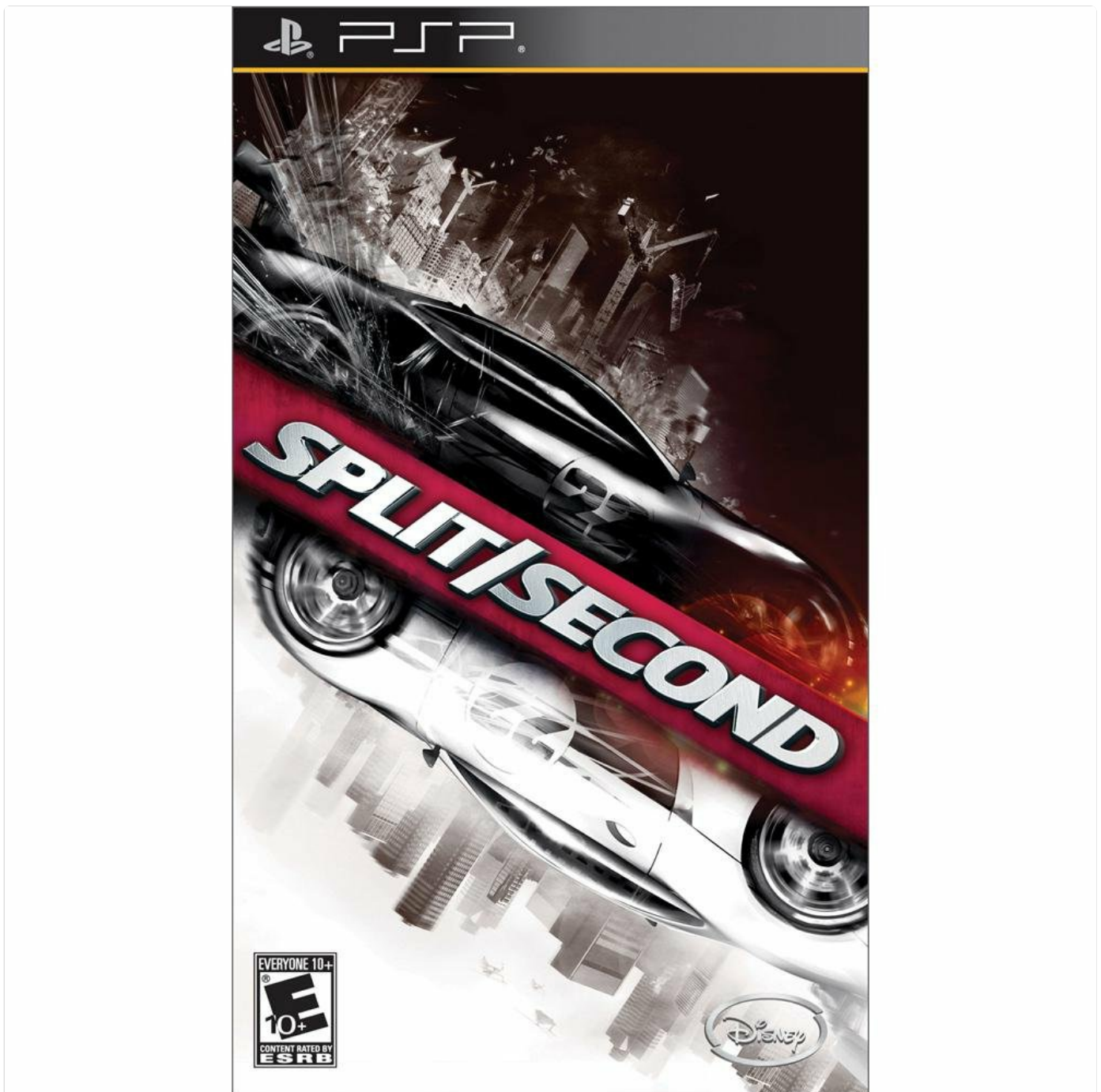
Figure 1.1: The official game cover for Split/Second on Sony PSP. It features two stylized racing cars, one black and one white, with the game title prominently displayed against a backdrop of a city skyline and explosive effects, emphasizing the game's destructive racing theme.