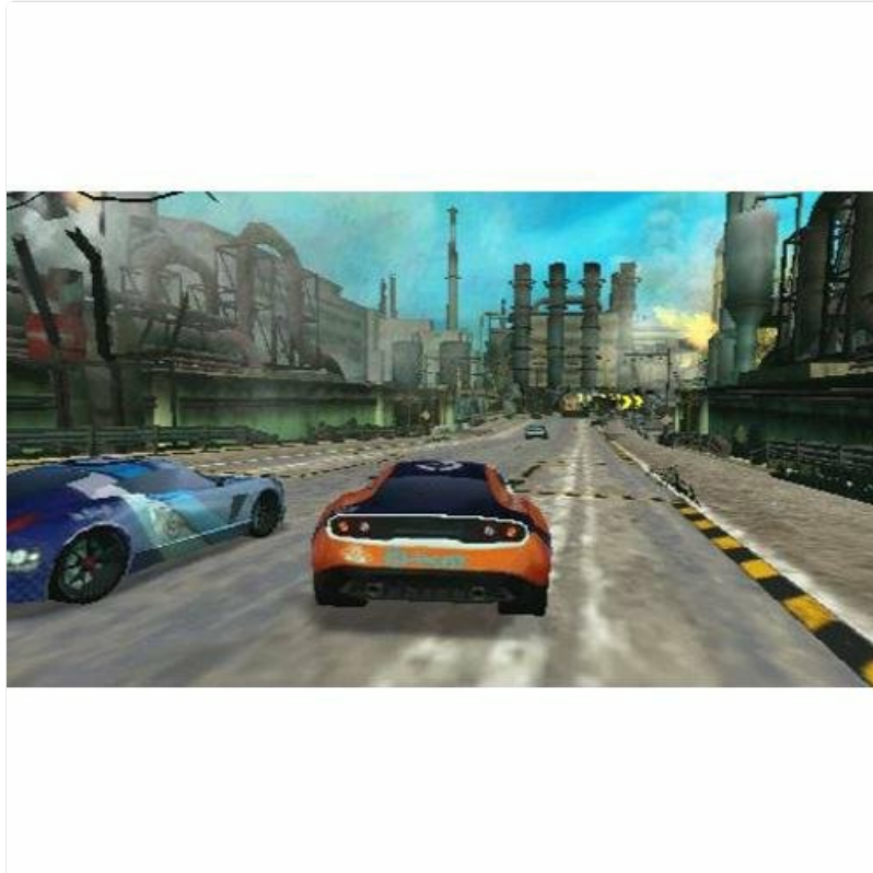
Figure 3.4: An in-game screenshot featuring two racing cars navigating through an industrial environment with large pipes and structures. The track appears to be part of a complex, urban setting, highlighting the varied race locations.