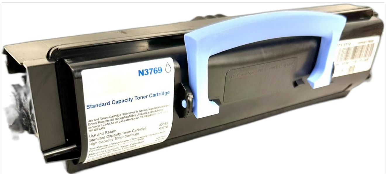
Figure 4: The Dell N3769 Standard Capacity Toner Cartridge itself, showing its black body and light blue handle for installation.