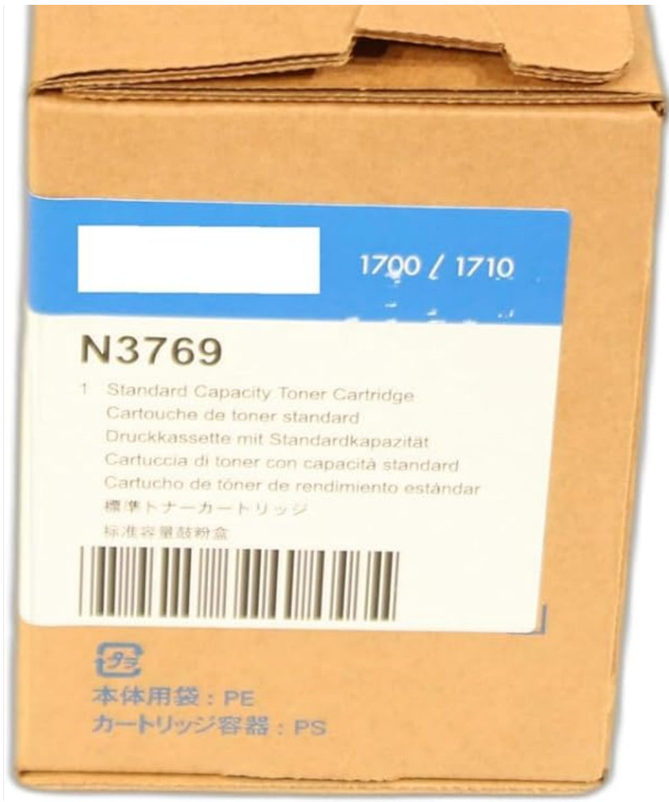
Figure 2: Side view of the Dell N3769 toner cartridge retail box, showing the blue label and packaging details.