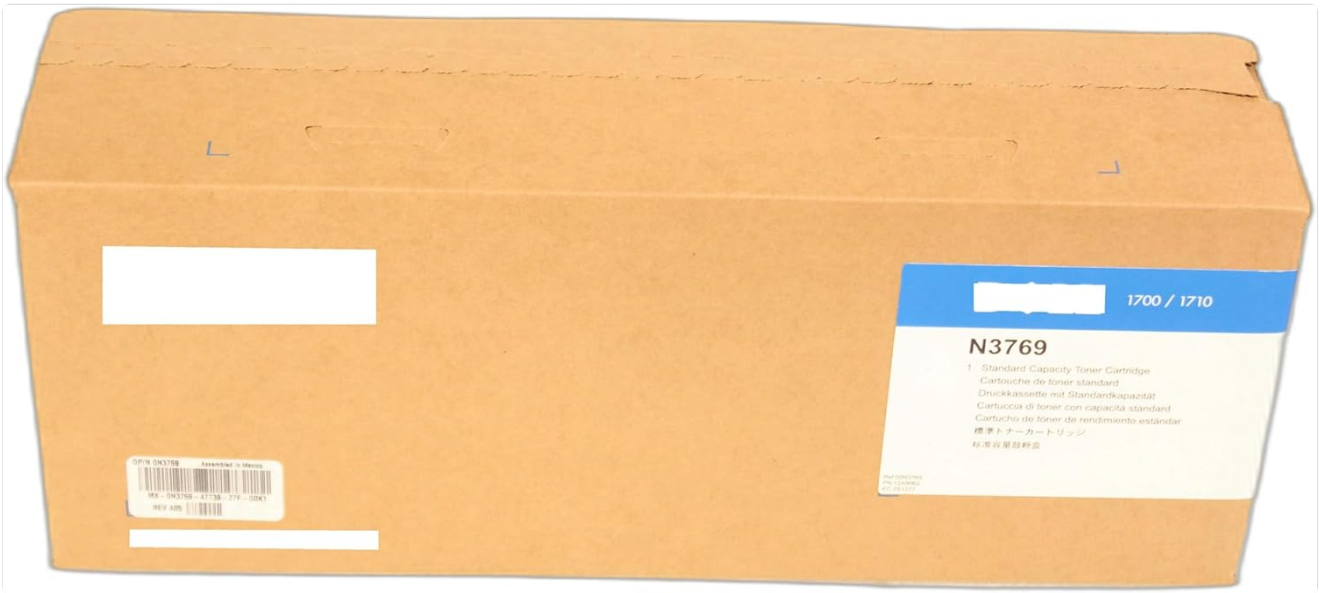
Figure 1: Front view of the Dell N3769 toner cartridge retail box. The box is brown cardboard with a blue label indicating "N3769" and "1700 / 1710" compatibility.