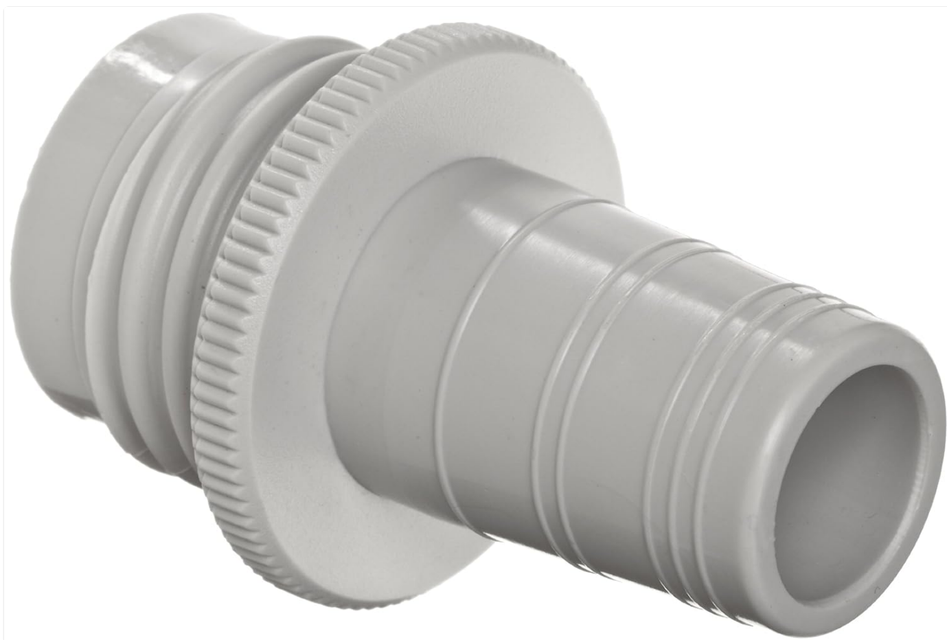
Figure 1: Angled view of the BrandTech 2704838 Polypropylene Bottle Thread Adapter. This image shows the adapter's overall shape, including the threaded end for bottle connection and the tapered end for the STJ 24/40 joint.