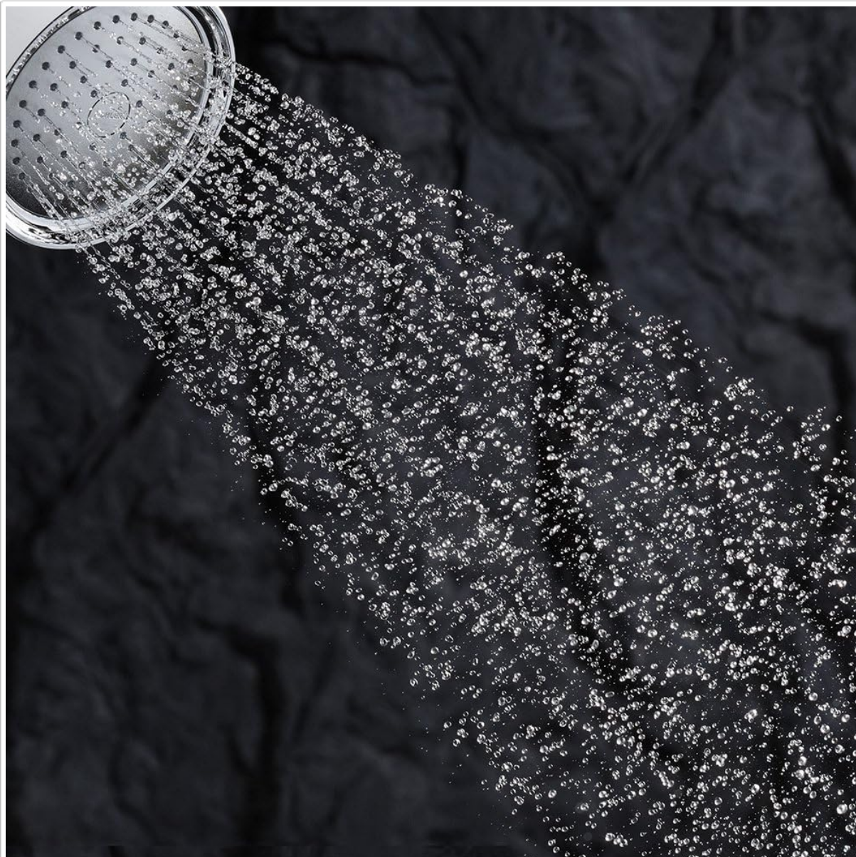
Image: The Kohler Purist showerhead in operation, demonstrating the powerful Katalyst spray.