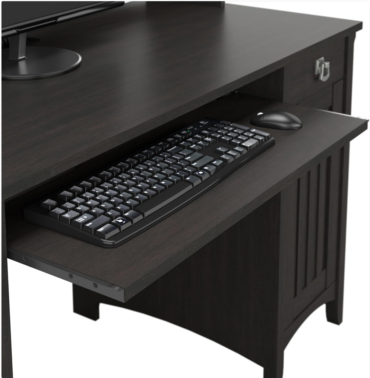
Image: A close-up of the integrated pull-out keyboard tray, extended to show space for a keyboard and mouse.