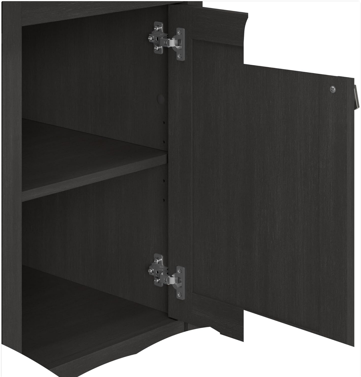
Image: An open view of the desk's vertical storage cabinet, revealing internal shelving for organization.