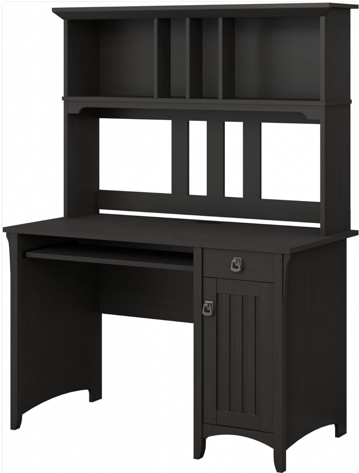
Image: The Bush Furniture Salinas Computer Desk with Hutch, showcasing its Vintage Black finish and overall design.