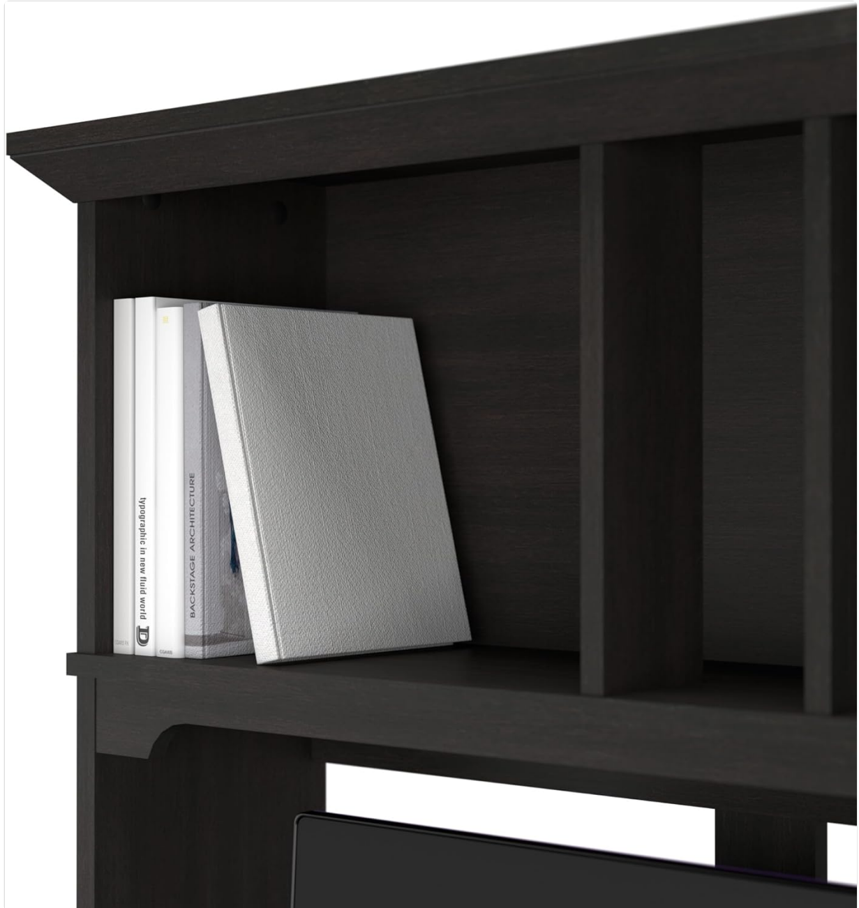
Image: The open hutch shelves, demonstrating their use for storing books and displaying decorative objects.

The open hutch shelves offer convenient storage and display space for books, decorative items, or work-in-progress files. These shelves help maximize vertical space and keep frequently used items within reach.