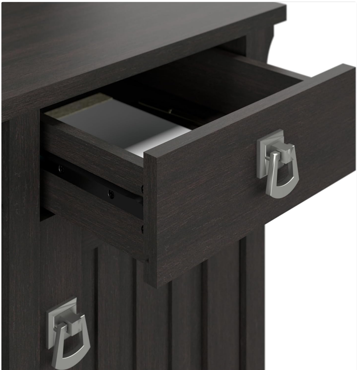
Image: The desk's storage drawer, partially open, illustrating its capacity for office supplies.

The box drawer is ideal for organizing office supplies, pens, and other small items. It features smooth ball-bearing glides for easy access.