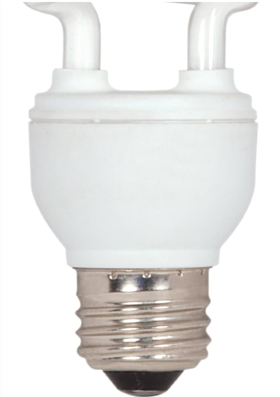
Image 1.1: The Satco S7231 26-Watt T2 Mini Spiral CFL Lamp. This image shows the compact fluorescent bulb with its characteristic spiral tube and a standard medium screw-in base.