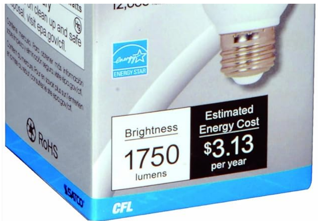
Image 3.1: Packaging for the Satco S7231 CFL Lamp. The packaging highlights key features such as "Energy Saver," "26W Soft White," "2700K," and "12,000 Hours" lifespan.