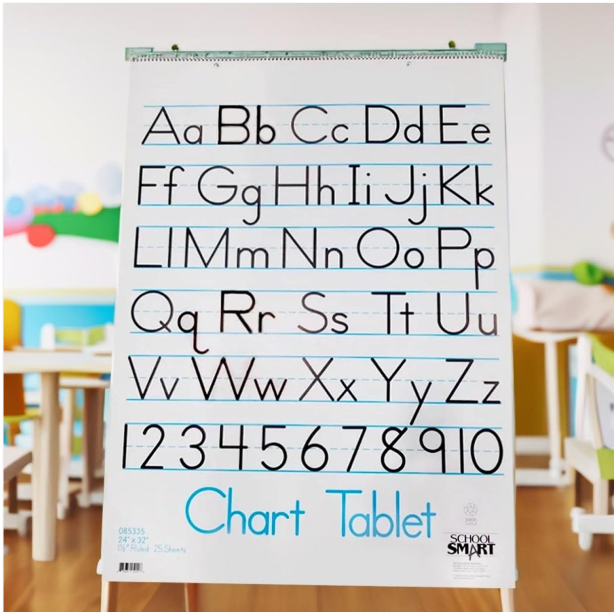
Image: School Smart Chart Paper Pad displayed on an easel, illustrating its use for teaching alphabet and numbers.