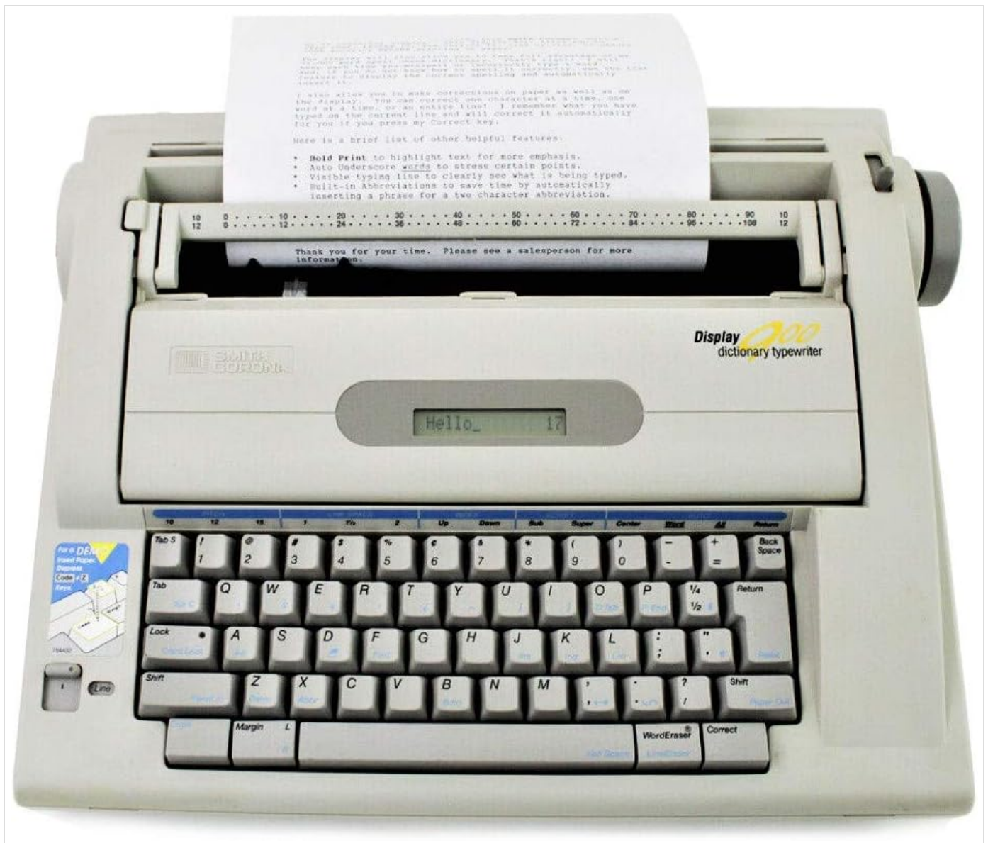
Image: Front view of the Smith Corona Model 900 typewriter, demonstrating a sheet of paper correctly loaded into the machine.