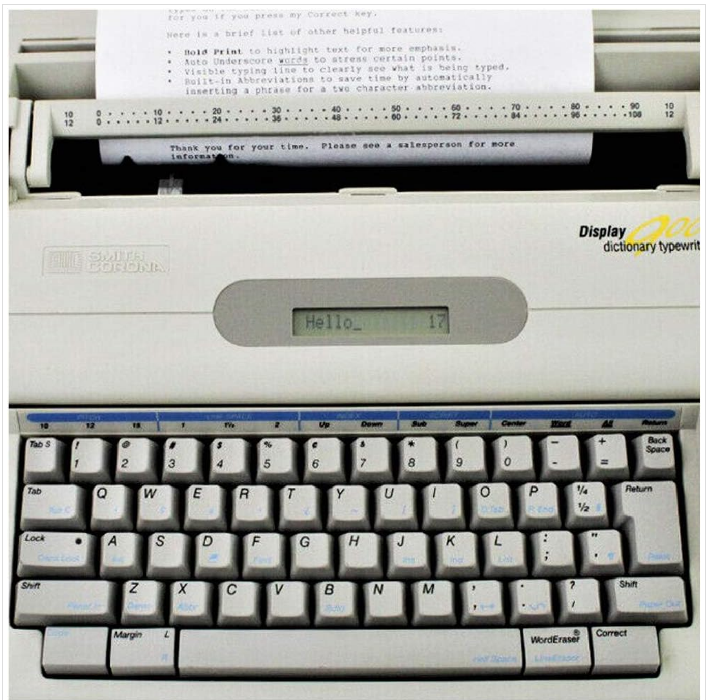
Image: A detailed view of the Smith Corona Model 900's keyboard and the integrated display, which shows the word "Hello" as it is being typed.