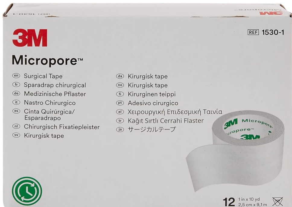
Figure 3: The 3M Micropore tape is ready for use directly from its packaging.