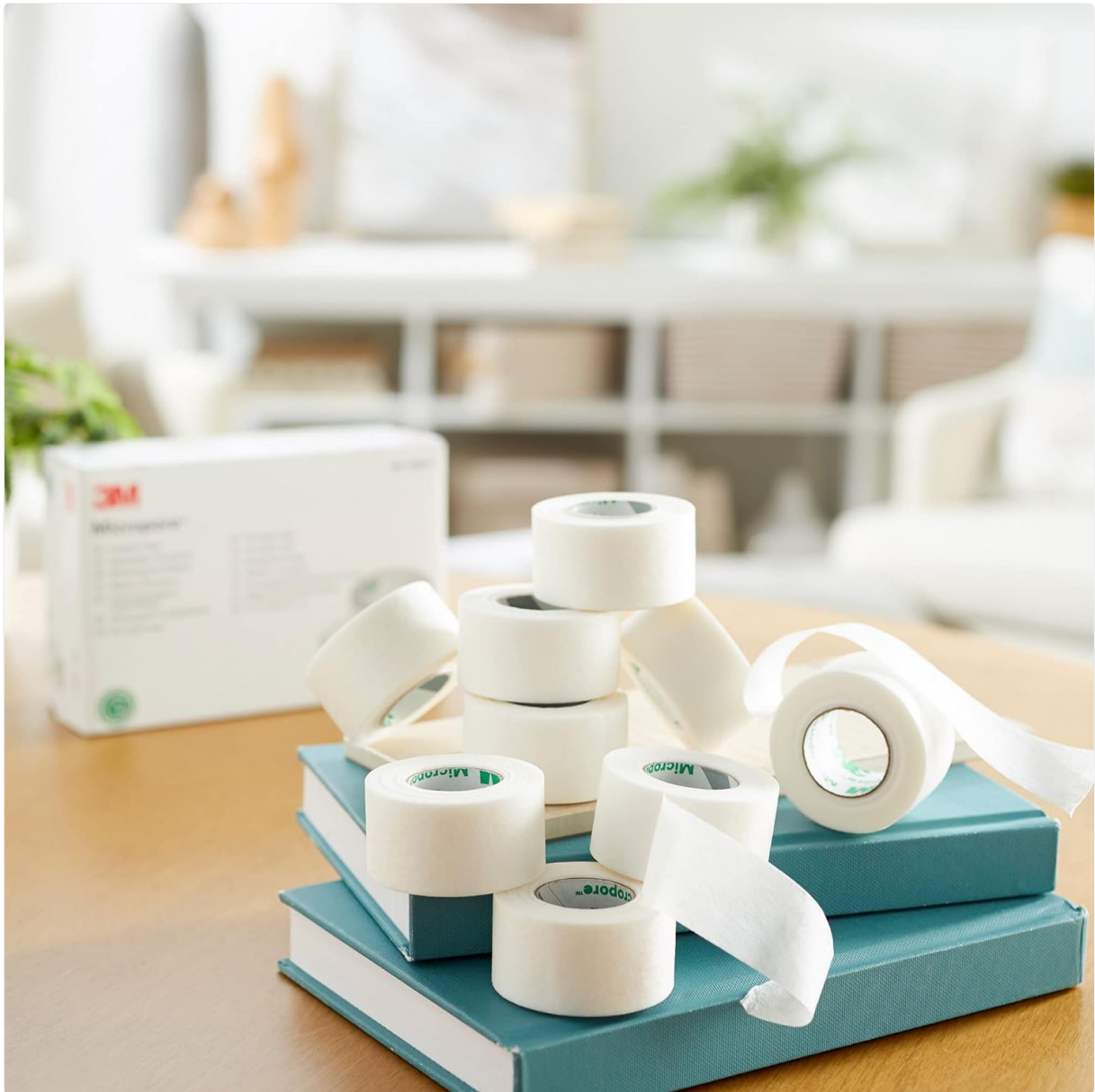
Figure 2: Close-up view of the breathable paper texture of 3M Micropore Tape.