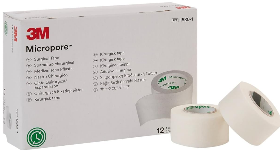
Figure 1: 3M Micropore Paper Surgical Tape, 1" x 10yds (Box of 12)