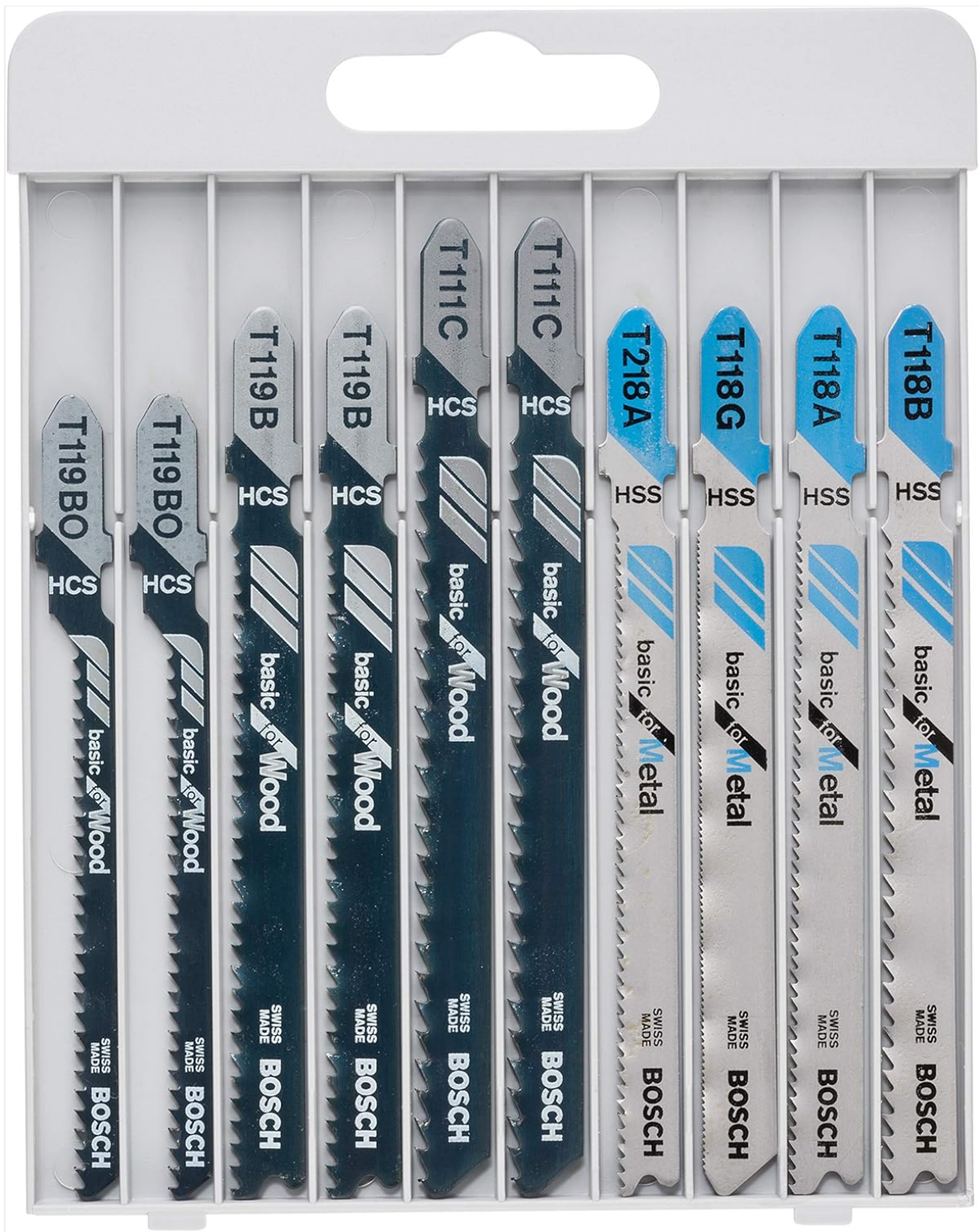
Image 2: A detailed view of the various jigsaw blades included in the set, showing their model numbers and intended material thickness.