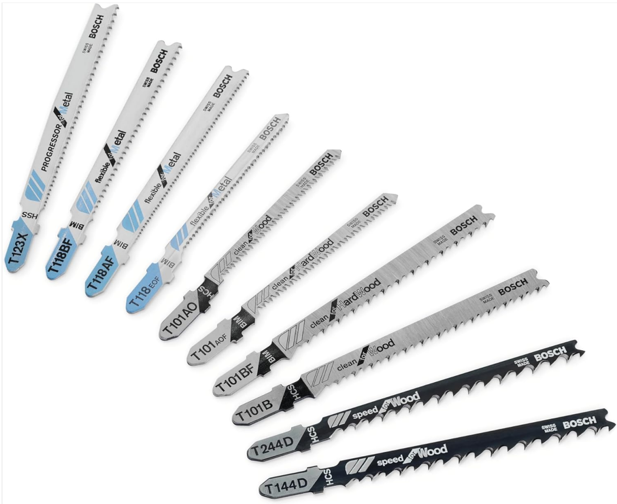
Image 1: The Bosch 10-piece Jigsaw Blade Set, Classic Industrial, in its transparent storage case.