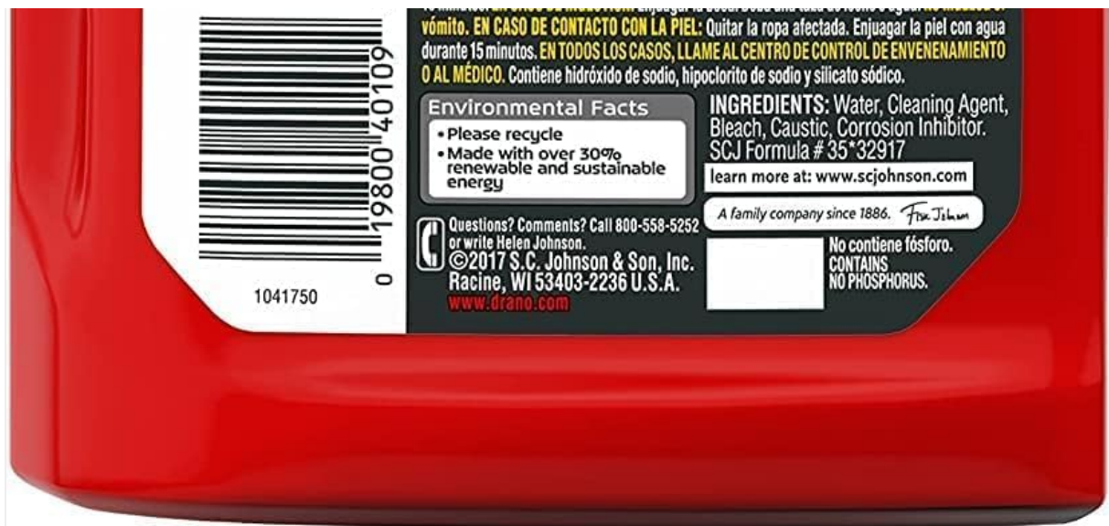
Image: The product's back label, providing comprehensive safety warnings and usage guidelines.