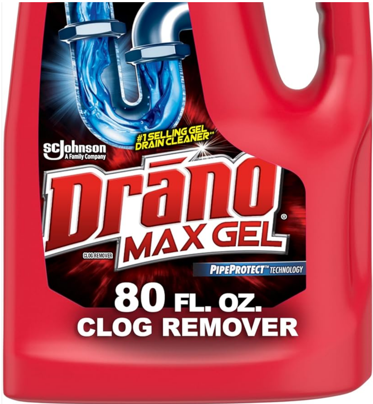
Image: Drano Max Gel 80 oz bottle, showcasing its value size and effectiveness on hair clogs.