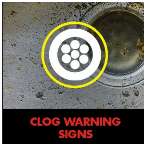
Image: Graphic illustrating common signs of a drain clog, useful for identifying when preventative action is needed.

Regular use of Drano Max Gel can help prevent clogs from forming, saving you time and potential plumbing costs. Act on slow-running drains before they become complete blockages.