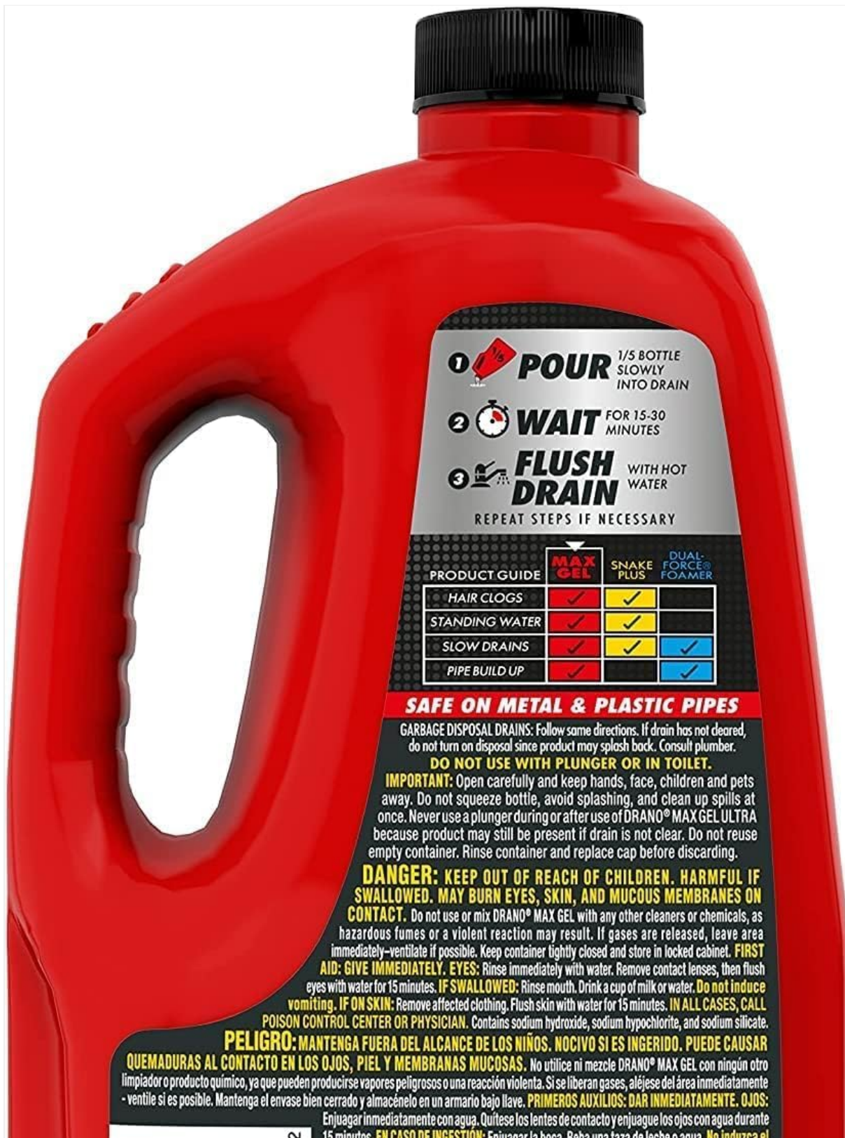
Image: Important safety precautions for using Drano Max Gel, detailing actions to take and avoid.