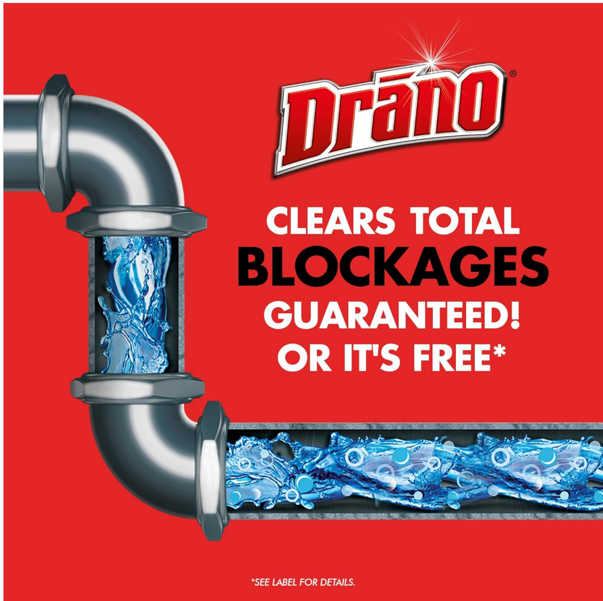
Image: Drano Max Gel's guarantee to clear total blockages, showing water flowing freely through a pipe.