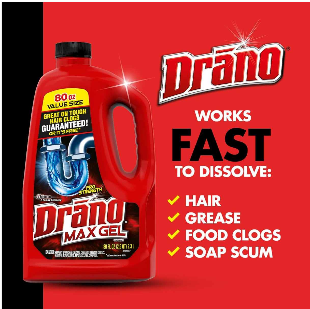
Image: Visual representation of Drano Max Gel's fast action against common drain blockages like hair, grease, food clogs, and soap scum.