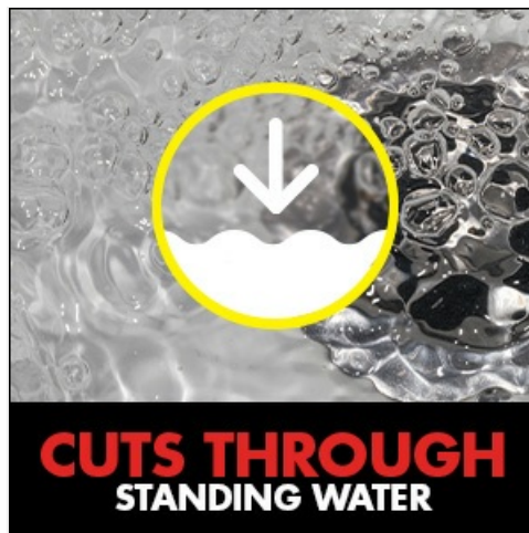
Image: Illustration demonstrating how Drano Max Gel's thick formula penetrates standing water to reach the clog directly.