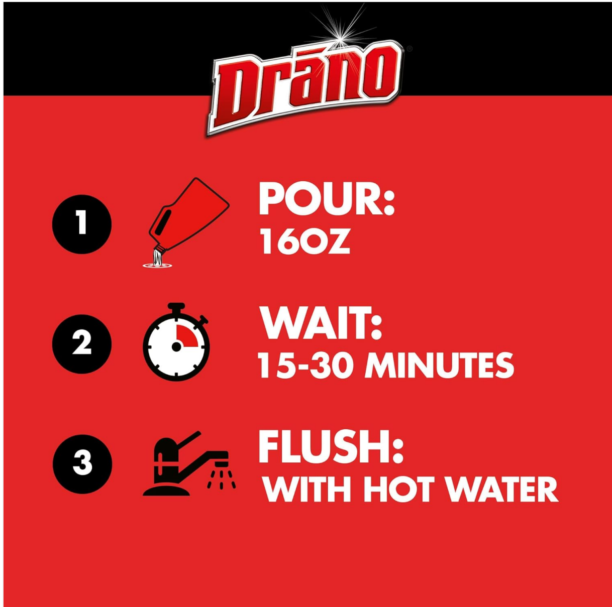
Image: Simple three-step guide for using Drano Max Gel: Pour, Wait, and Flush with hot water.