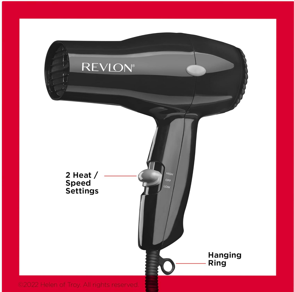
Detail of the heat and speed settings switch on the handle.