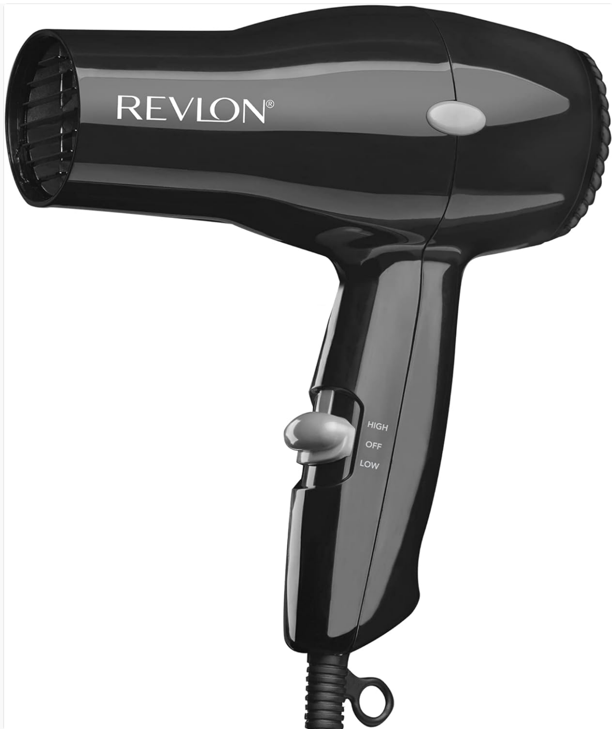
Image: The REVLON Essentials Compact Hair Dryer, black model.