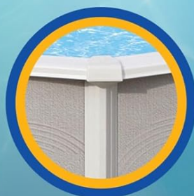
Resin Top Caps Shields joints from rusting