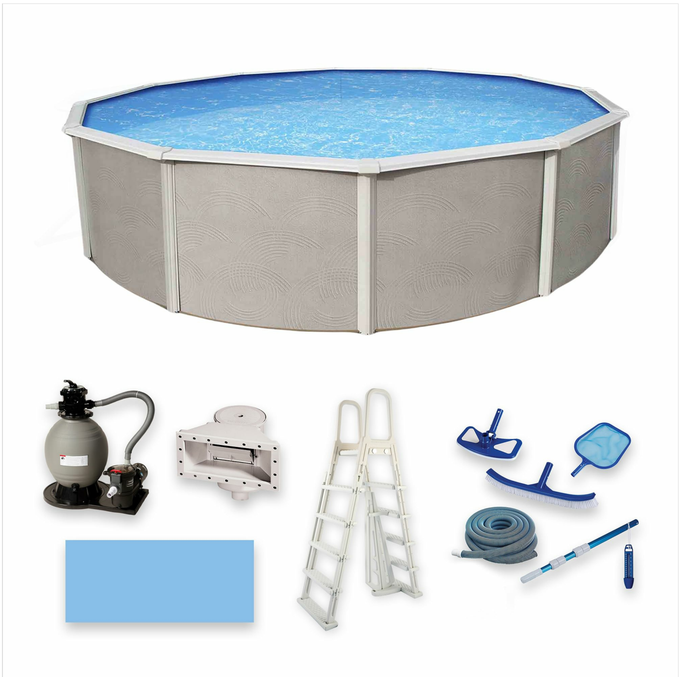
Image: The Belize 24-ft Round Above-Ground Swimming Pool, showcasing its round shape and metallic wall design, installed in a green lawn.