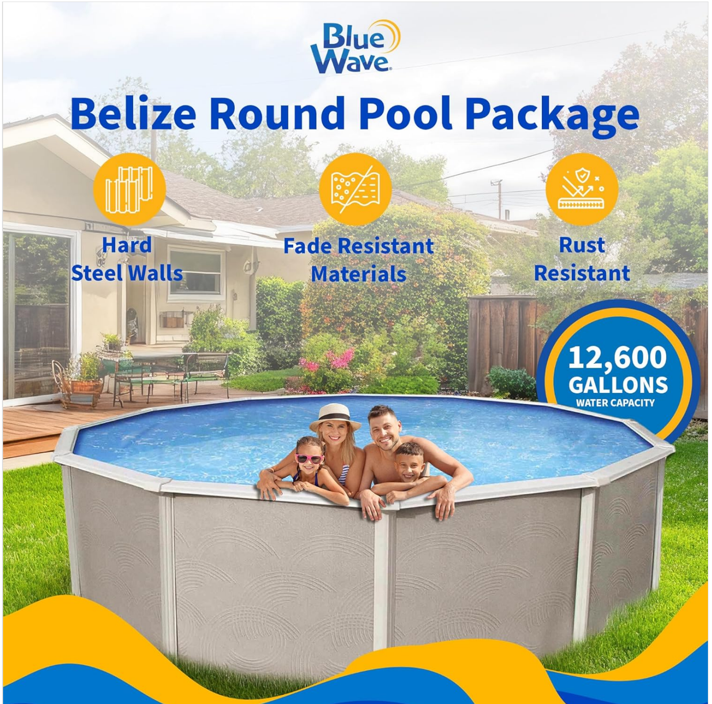
Image: An overview of the Belize Round Pool Package, highlighting features like hard steel walls, fade-resistant materials, rust resistance, and a 12,600-gallon water capacity as depicted in the image.