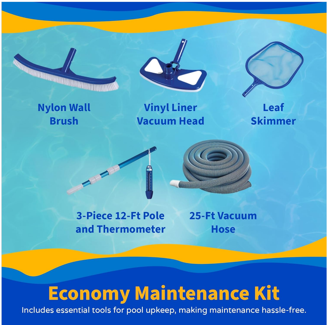
Image: Components of the Economy Maintenance Kit, including a nylon wall brush, vinyl liner vacuum head, leaf skimmer, 3-piece pole, thermometer, and vacuum hose.