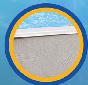
6-Inch Top Rails Strengthens the pool frame

Image: An illustrative diagram of the Belize pool, detailing its 24-ft diameter and 52-inch depth, along with key components like steel uprights, resin top caps, and 6-inch top rails.