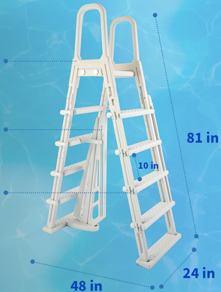
Image: A detailed view of the A-frame pool ladder, highlighting its dimensions and sturdy construction for safe entry and exit.