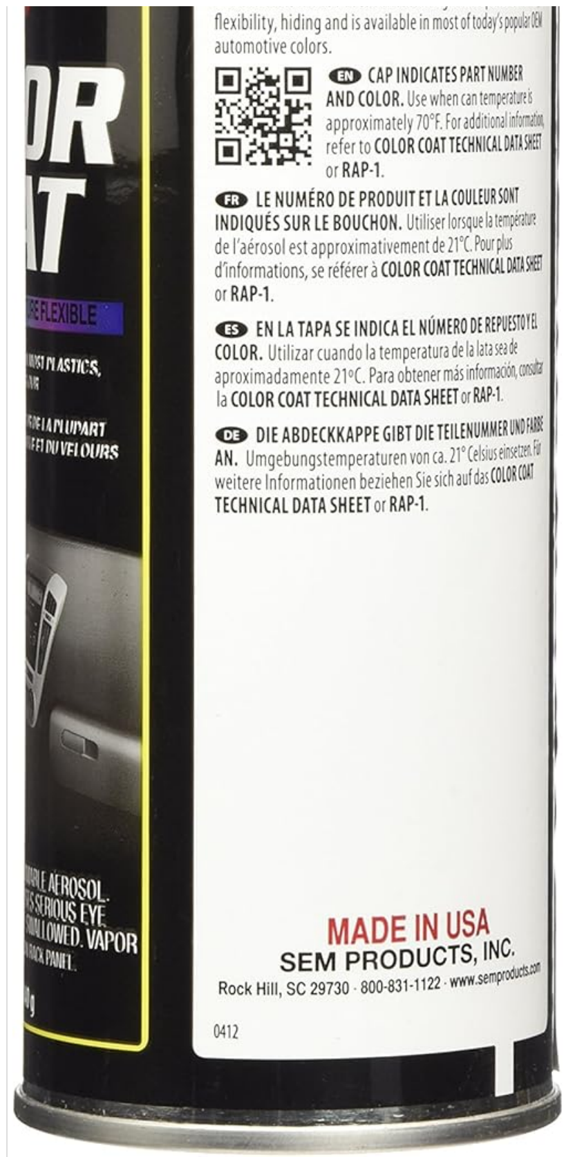
Image: Side view of the SEM Color Coat aerosol can, showing general application instructions and product details.