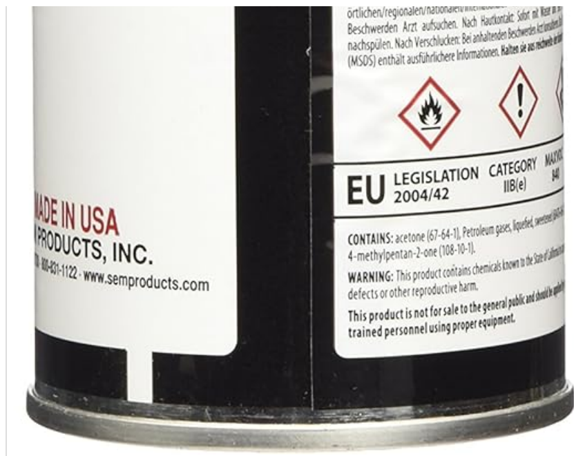
Image: Back view of the SEM Color Coat aerosol can, displaying safety warnings and product information.