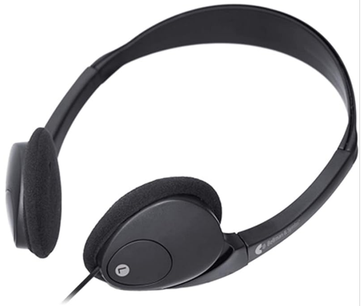
Image 1.1: The Bellman Audio Maxi BE2020 amplifier shown with its included headphones.