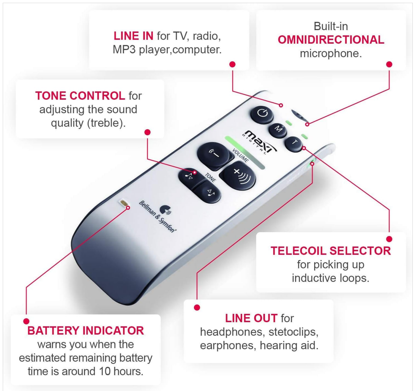
Image 2.1: Detailed diagram illustrating the controls and connection points on the Bellman Audio Maxi BE2020 amplifier.