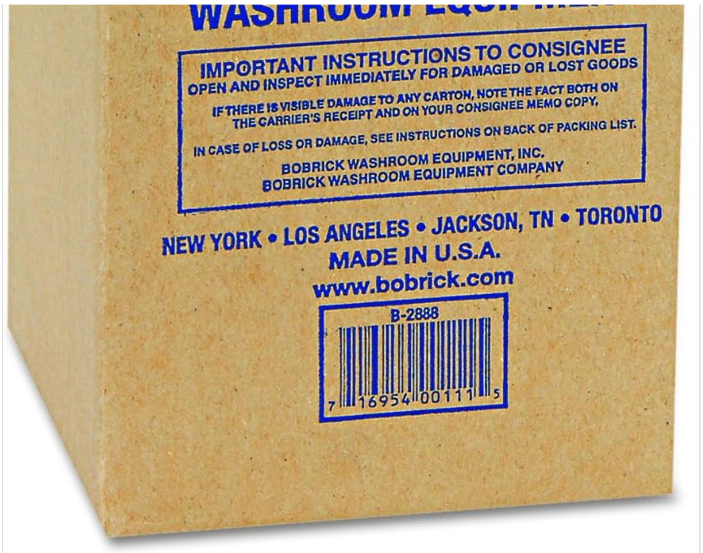
Figure 2: Packaging box for the Bobrick Model 2888 dispenser, indicating "MODEL B-2888" and "Made in U.S.A."