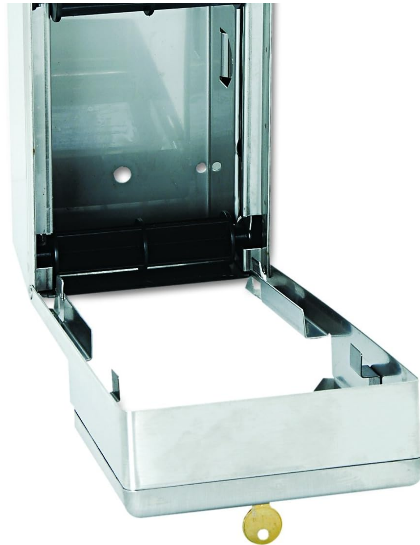
Figure 3: The Bobrick Model 2888 dispenser with its front cover open, revealing the internal mechanism, two roll spindles, and pre-drilled mounting holes on the back panel.