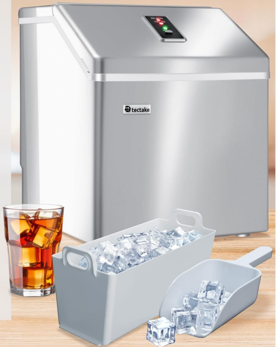
Image: The tectake Ice Maker Model 400162 in silver finish.

Boîtier robuste en acier laqué, extrêmement résistant