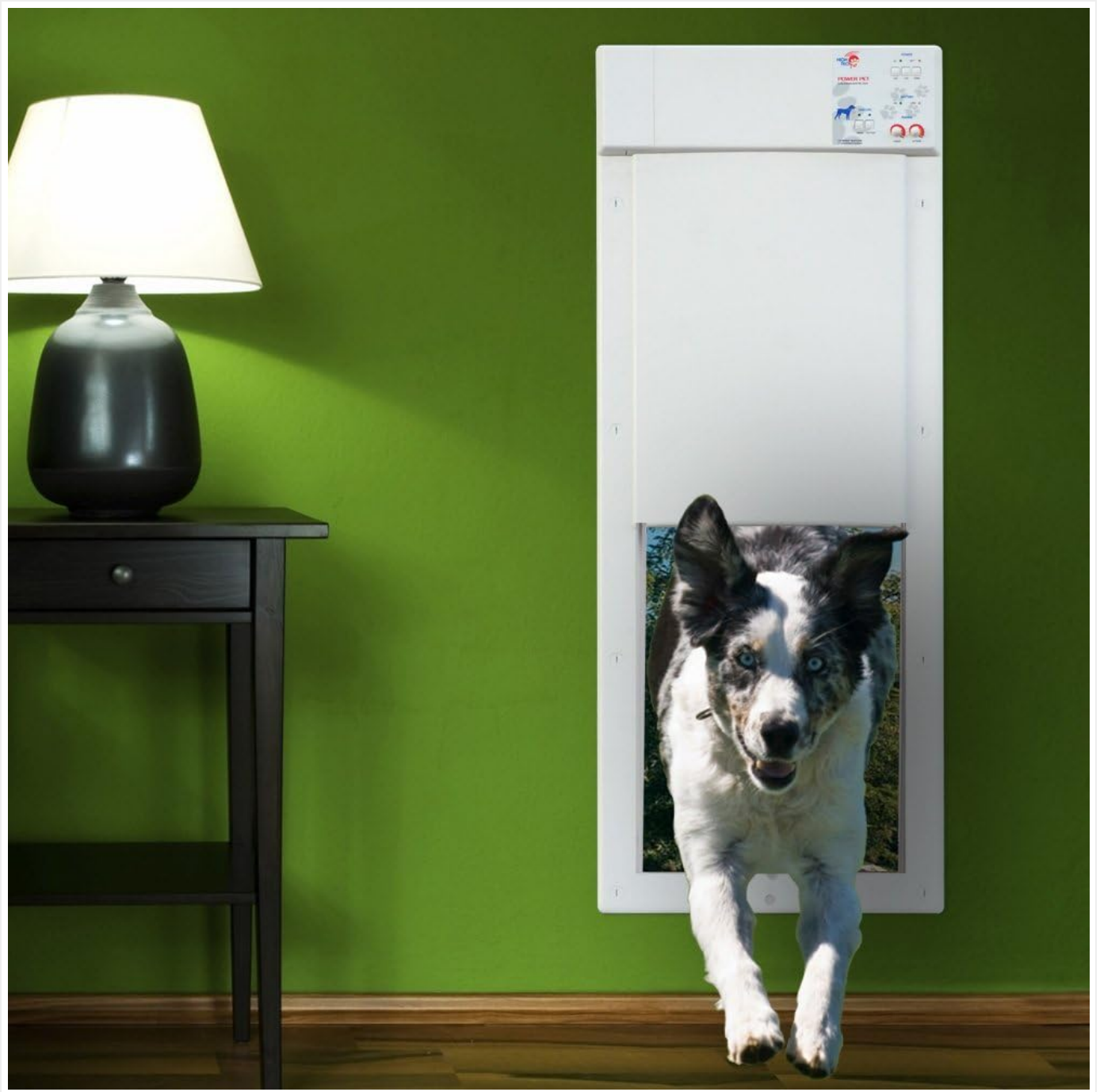
Image: A dog demonstrating the use of the electronic pet door, showing the door opening as the pet approaches.

pet's movement patterns and your desired activation distance.