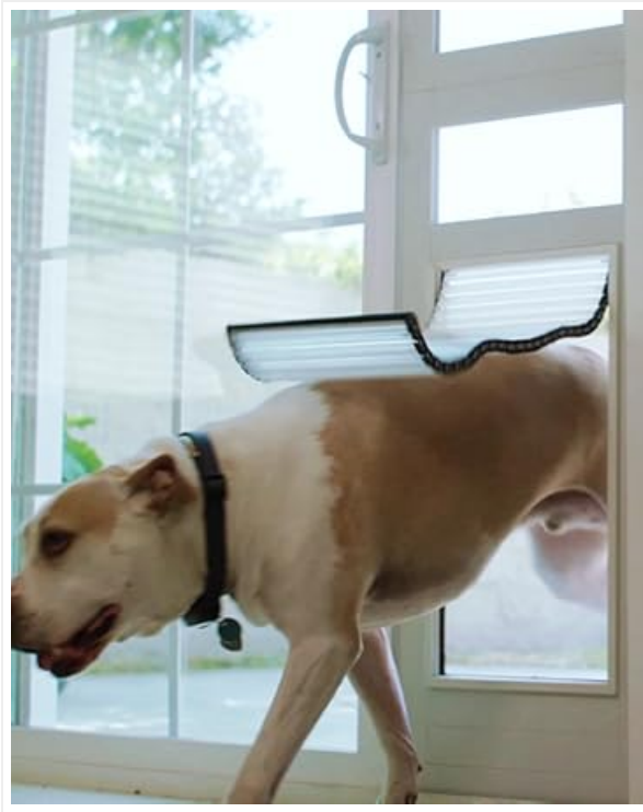
Image: A dog wearing the MS-4 ultrasonic collar, which activates the pet door.