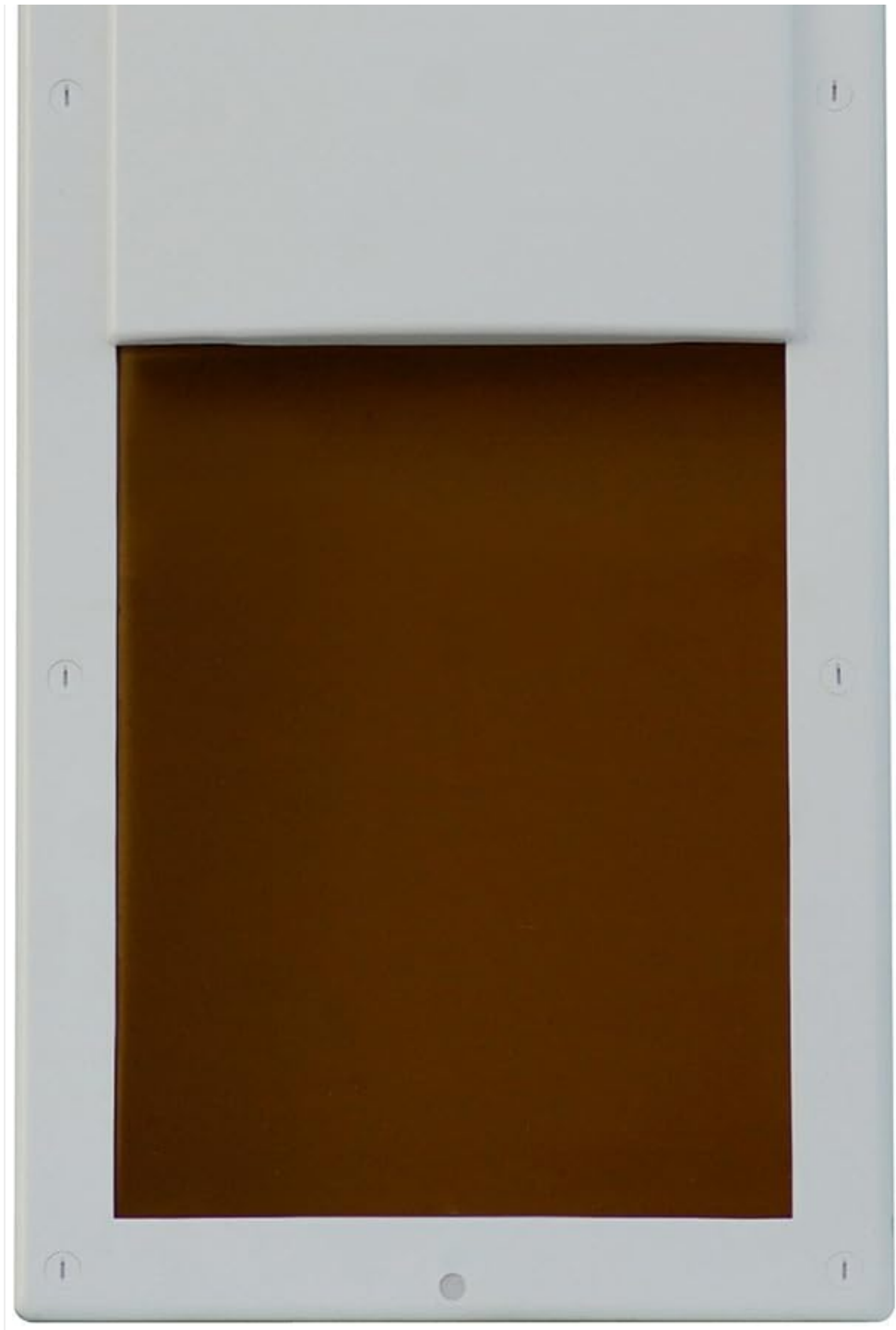
Image: The Power Pet Large Electronic Pet Door PX-2, showing its sleek white design and brown pet panel.