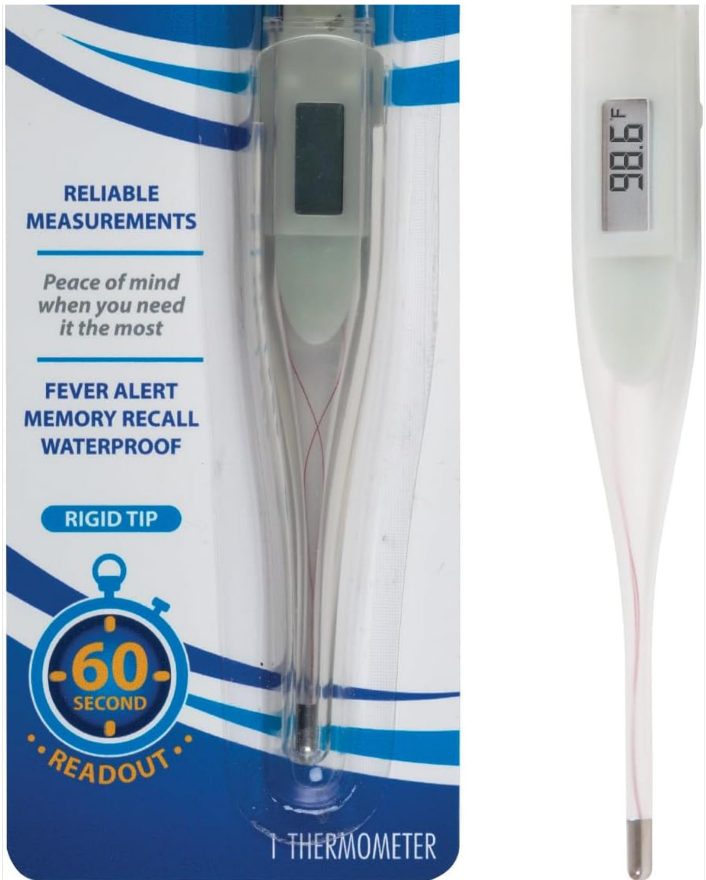
Image: A clear view of the Veridian Healthcare Digital Thermometer, both in its retail packaging highlighting features like 60-second readout and fever alert, and a separate close-up of the thermometer itself.