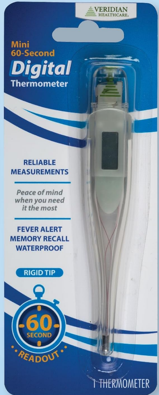
Image: The Veridian Healthcare Digital Thermometer and its retail packaging, illustrating the contents included in the box: the thermometer, a storage case, battery (pre-installed), and instructions.