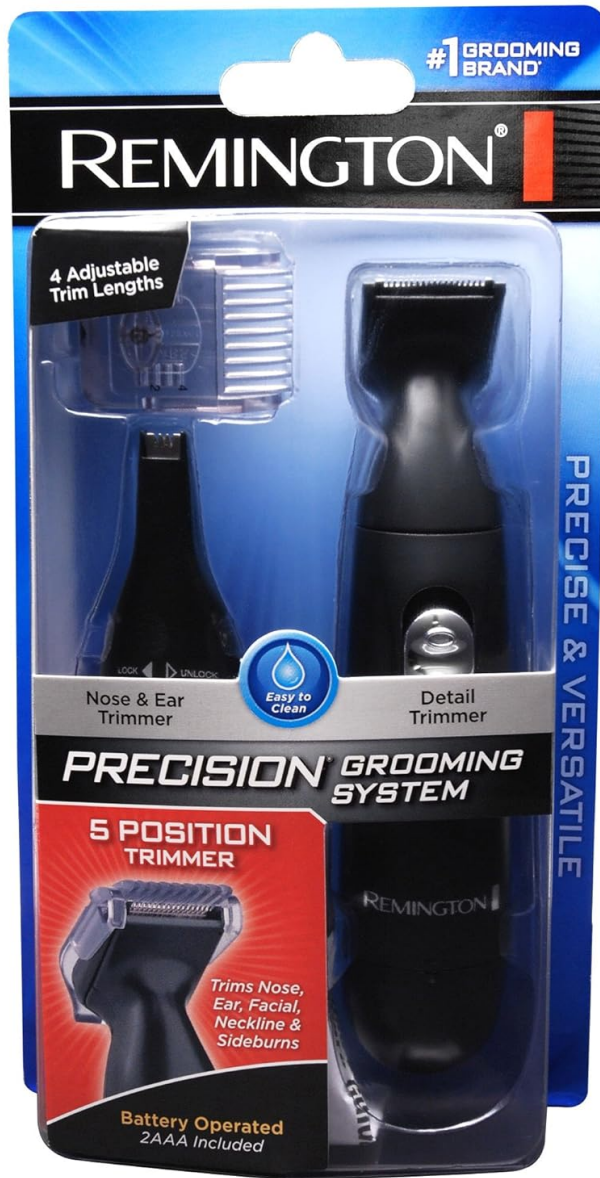
Image: The Remington PG165 unit with the linear nose and ear trimmer attachment installed.