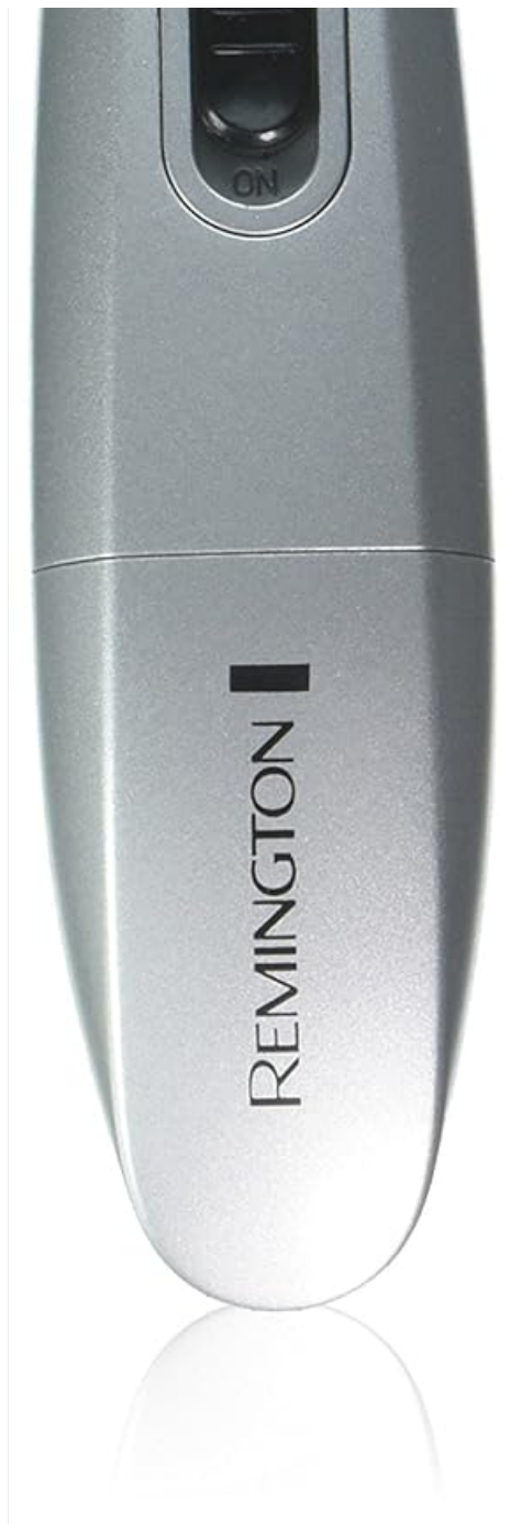
Image: The Remington PG165 Precision Grooming System, a silver-colored, sleek, battery-operated trimmer.