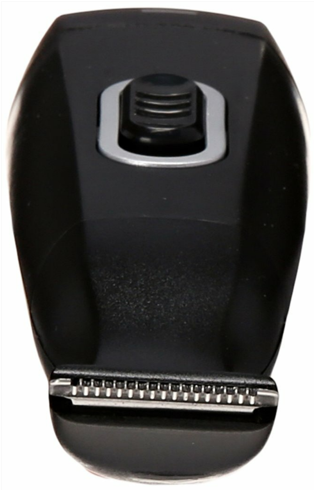
Image: The detail trimmer head, ready for attachment to the main unit.