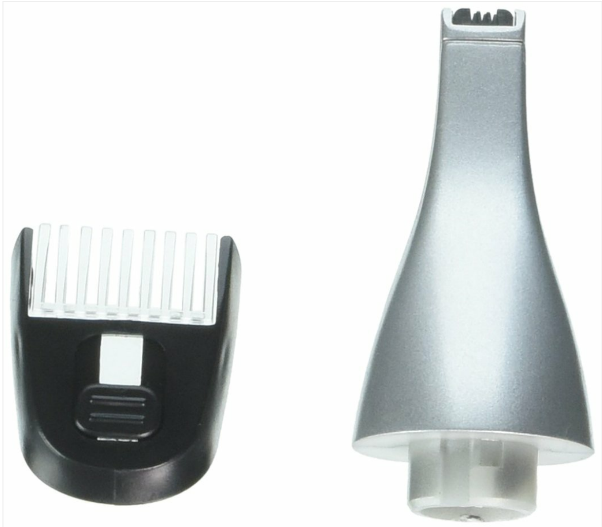
Image: The detail trimmer head shown alongside the adjustable comb attachment.