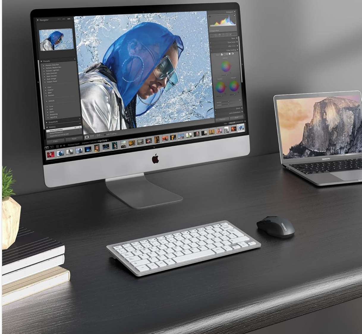
Image: The keyboard displayed with a desktop computer and a laptop, illustrating its wide compatibility with various operating systems and devices.