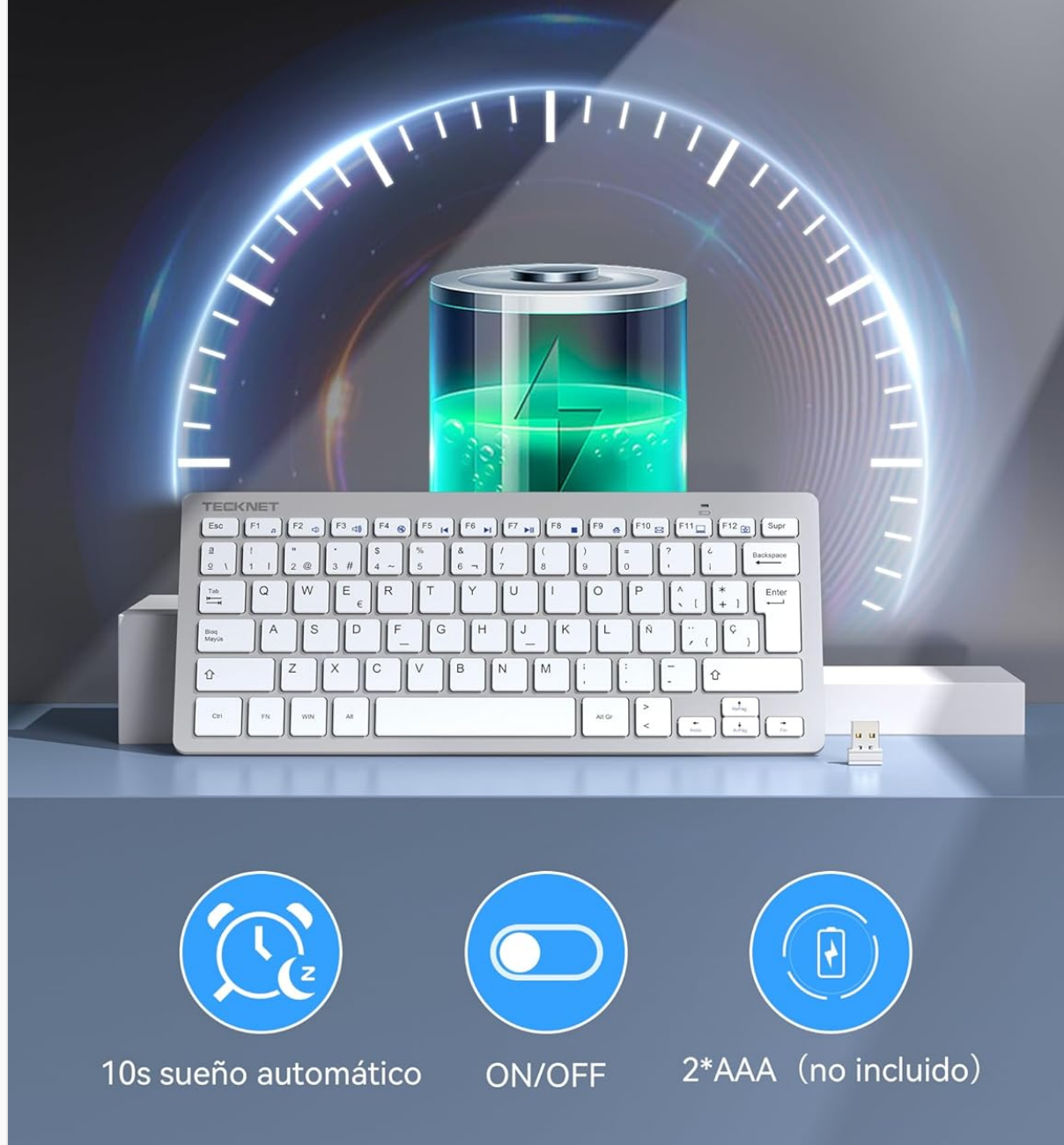
Image: Front view of the TECKNET 2.4G Wireless Mini QWERTY Keyboard X315 in silver.