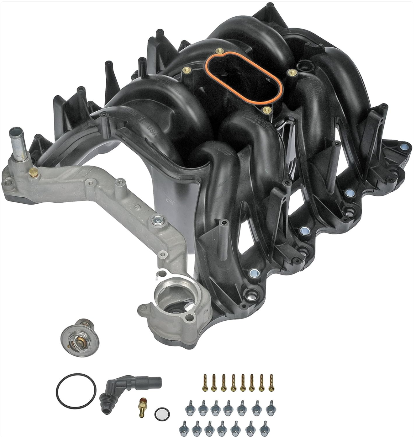
Figure 2: All components included in the Dorman 615-188 kit, showing the manifold, thermostat, O-ring, auxiliary coolant fitting, and various screws.