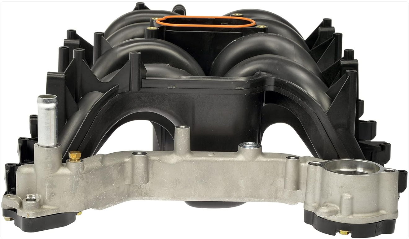
Figure 1: Overview of the Dorman 615-188 Plastic Intake Manifold.