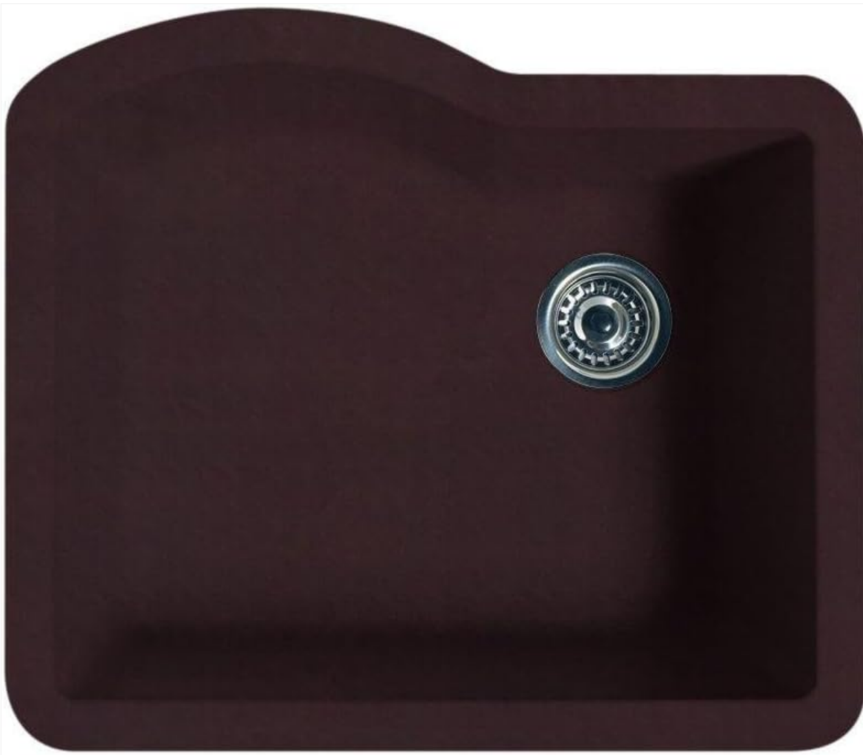
Figure 1: Full view of the Swanstone QU02522SB.170 Espresso granite undermount single-bowl kitchen sink, showing its rectangular shape with a rounded back corner and an offset drain.