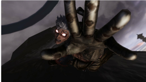
Asura shown with an outstretched, glowing hand, indicating a powerful attack or ability.