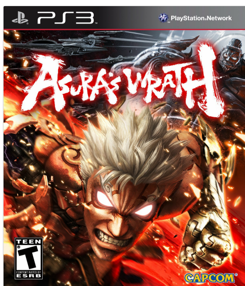
The official game cover for Asura's Wrath on PlayStation 3, featuring the protagonist Asura.