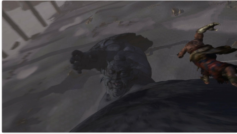
A screenshot depicting Asura engaged in combat with a colossal, stone-like adversary.