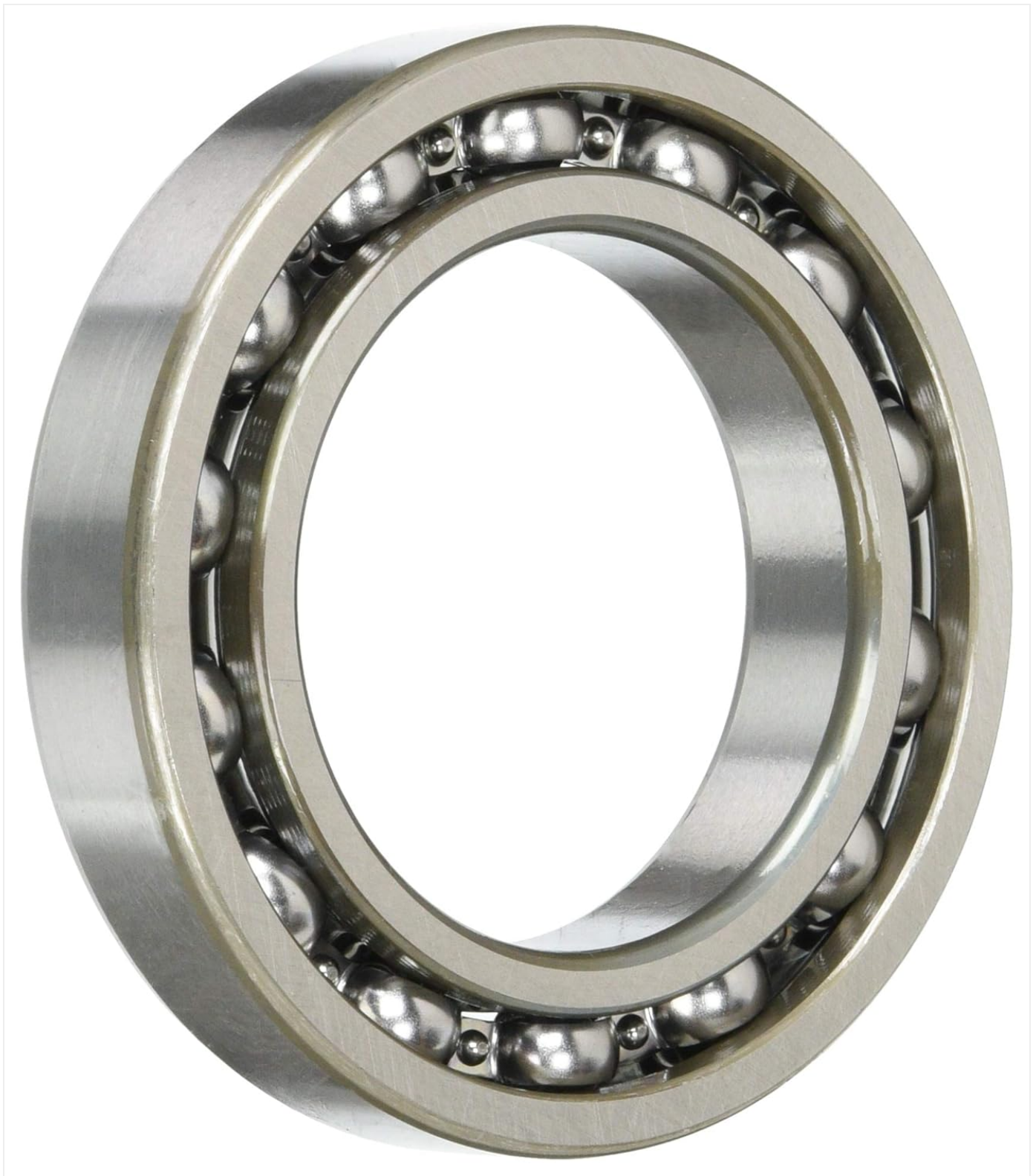
Figure 1: NTN 6012 Deep Groove Radial Ball Bearing. This image shows the bearing from a slight angle, highlighting the inner and outer rings, the steel balls, and the cage that spaces them evenly.