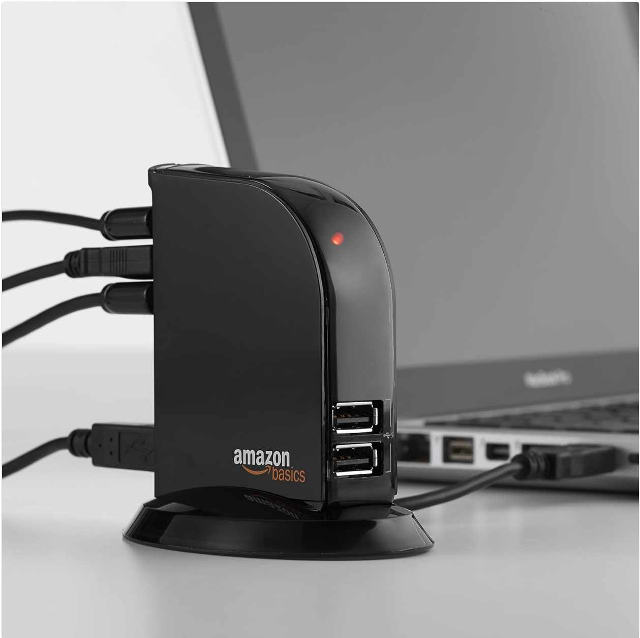
The USB hub in operation, with several USB devices connected, illustrating its use as an expansion port for a computer.