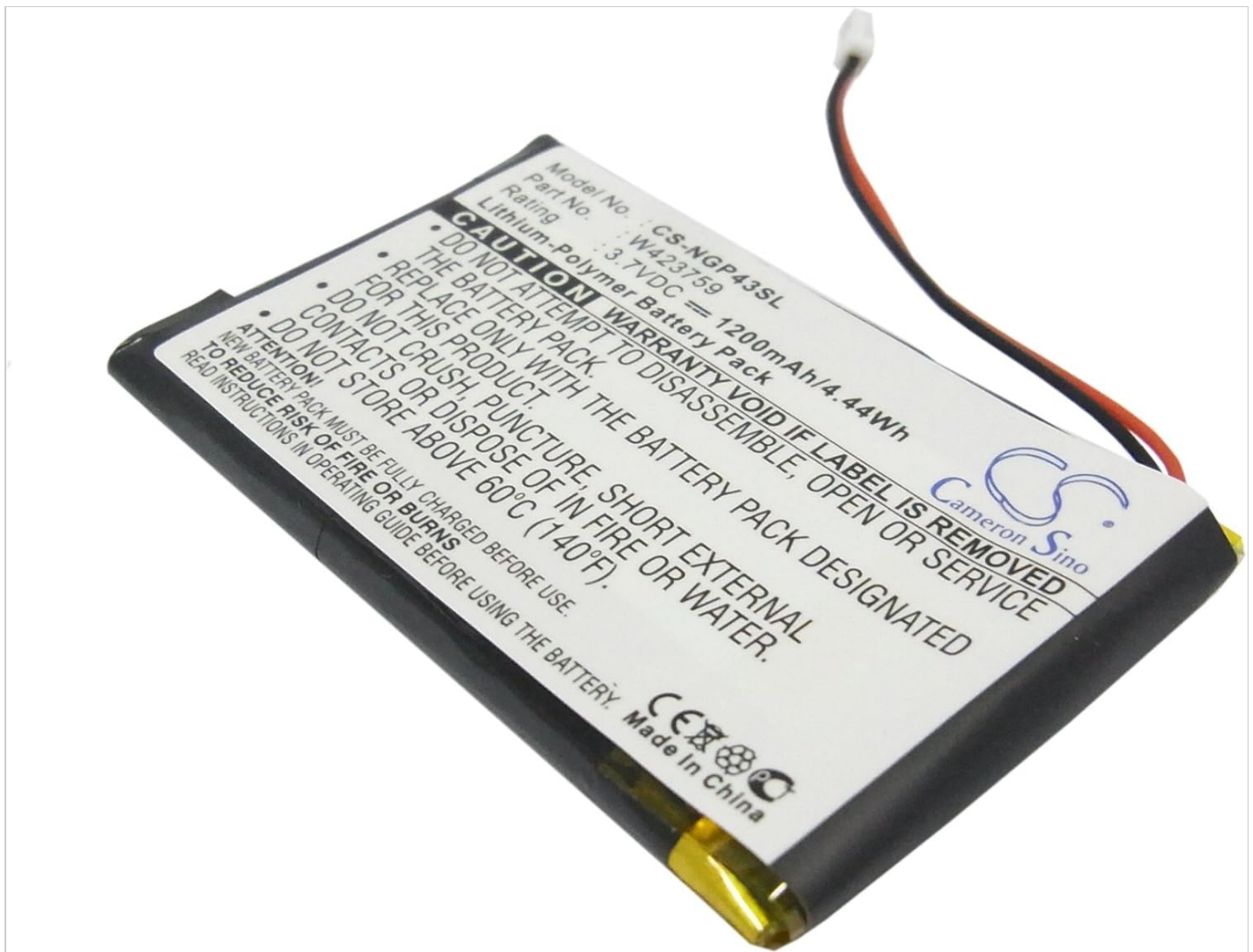
Image: Front view of the Cameron Sino CS-NGP43SL battery, showing the model number, voltage, capacity, and important safety warnings printed on the label.