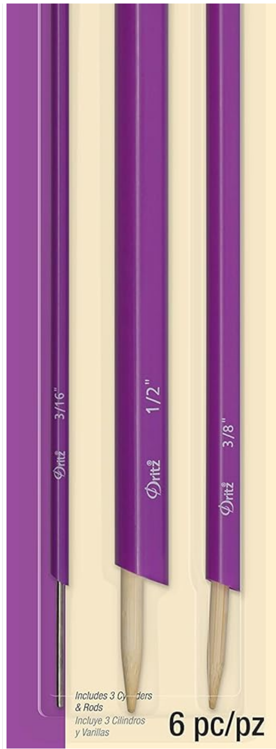
Image: The Dritz Quick Turn Fabric Tube Turners set, featuring three purple plastic cylinders with wooden rods, illustrating the different sizes included in the package.