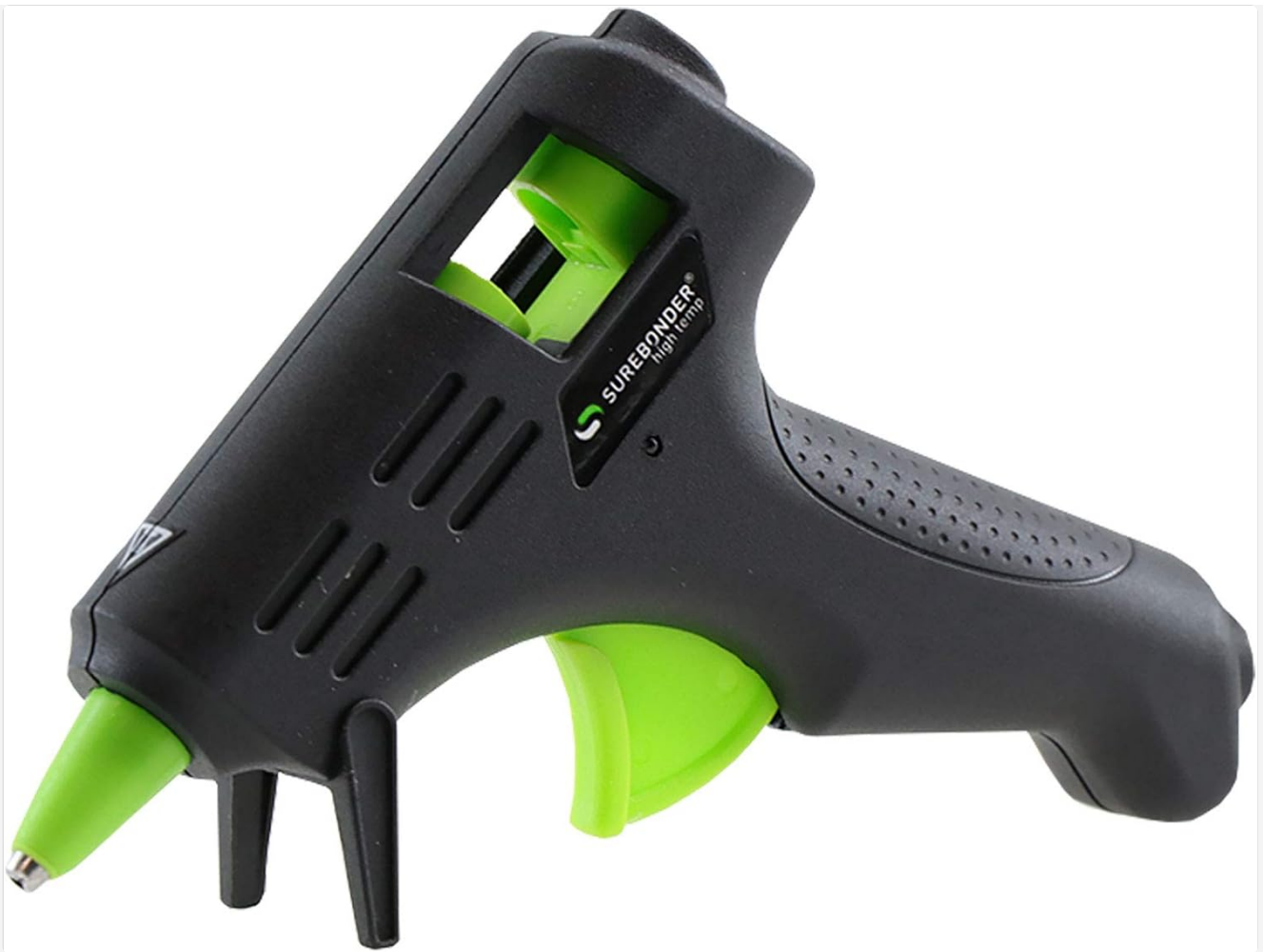
Image: The Surebonder GM-160 Compact Mini High-Temperature Hot Glue Gun, black with green accents, shown from a side angle.