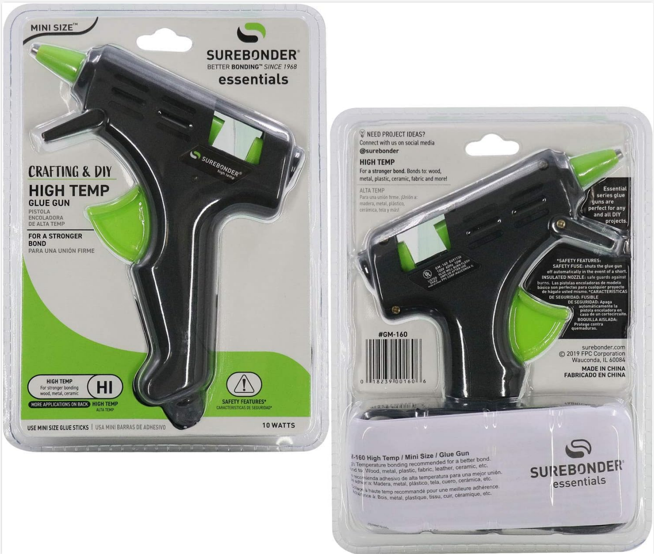
Image: Front view of the Surebonder GM-160 glue gun packaging, showing the product inside a clear blister pack.