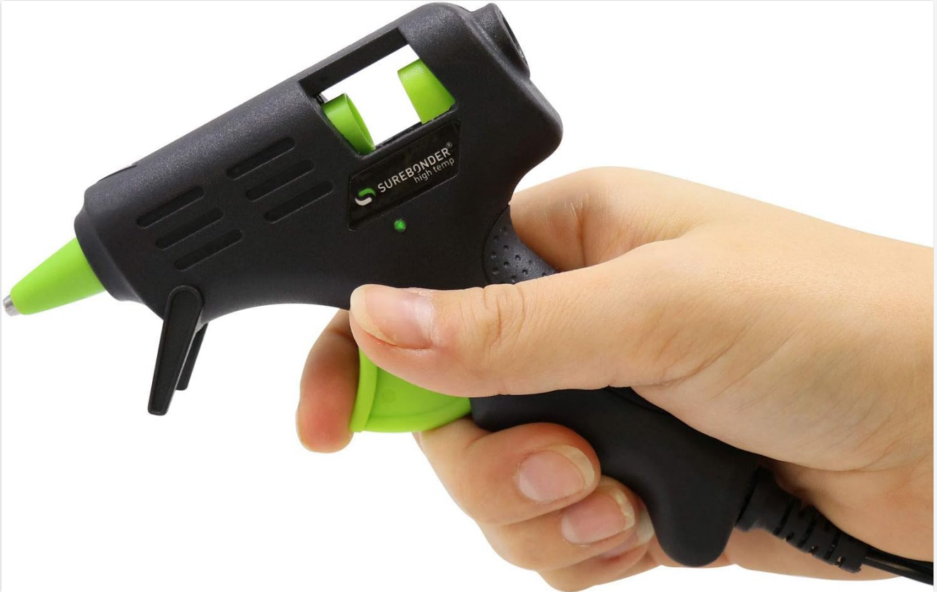
Image: A hand demonstrating the proper grip and use of the Surebonder GM-160 glue gun.