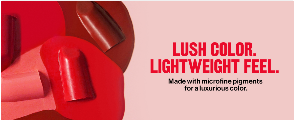
Image 4: Illustrates the lush color and lightweight feel of the lipstick.