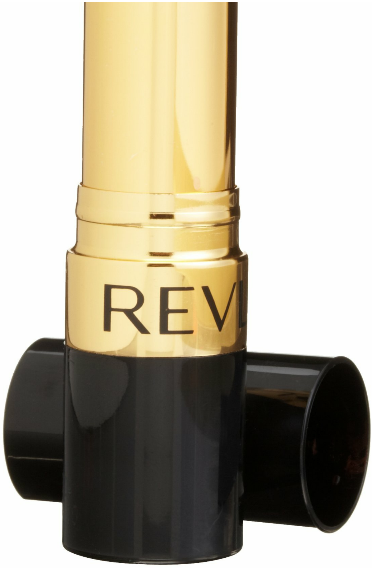
Image 1: Revlon Super Lustrous Lipstick in its packaging, showcasing the Va Va Violet shade.