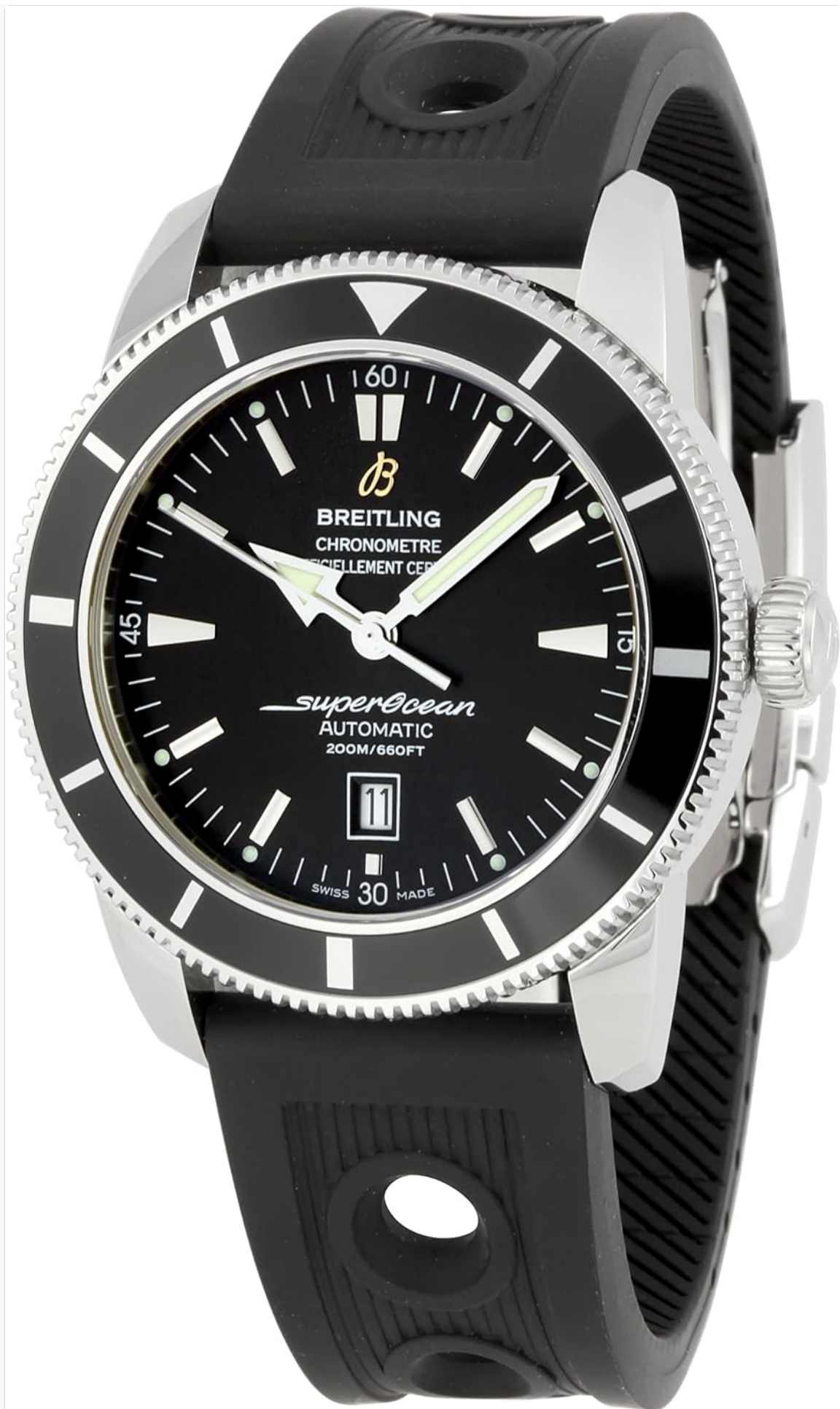
Image 1.1: The Breitling SuperOcean Heritage A1732024/B868 watch. This image displays the watch face with its black dial, luminous hands and markers, and the unidirectional rotating bezel. The stainless steel case and black rubber strap are also visible.