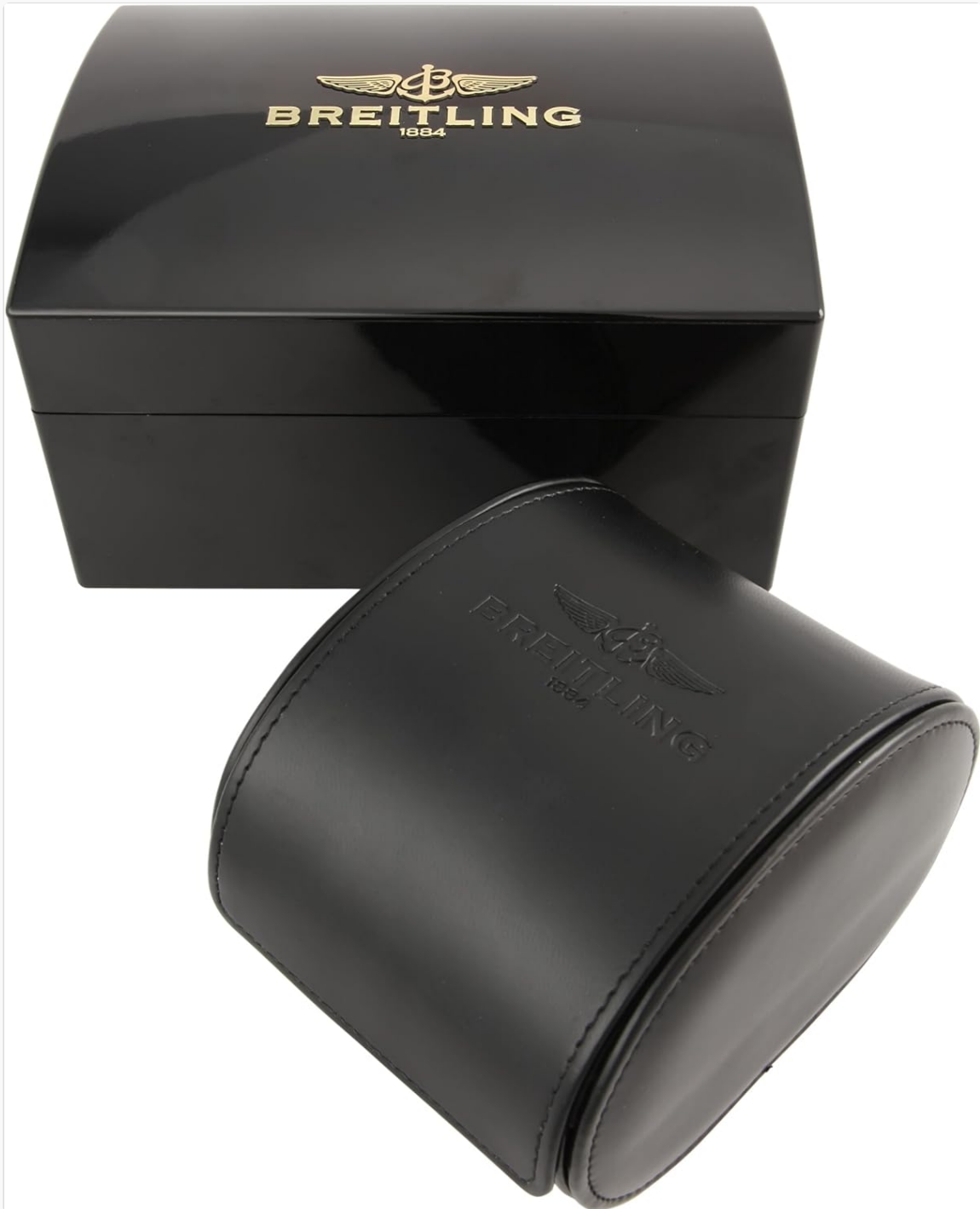
Image 2.1: The Breitling watch presentation box and a separate travel case. The main box is black with the Breitling logo, and the travel case is a cylindrical black leather pouch, also embossed with the brand logo.

Your Breitling watch comes securely packaged in a protective box. Carefully remove the watch and retain all packaging materials for future storage or transport.