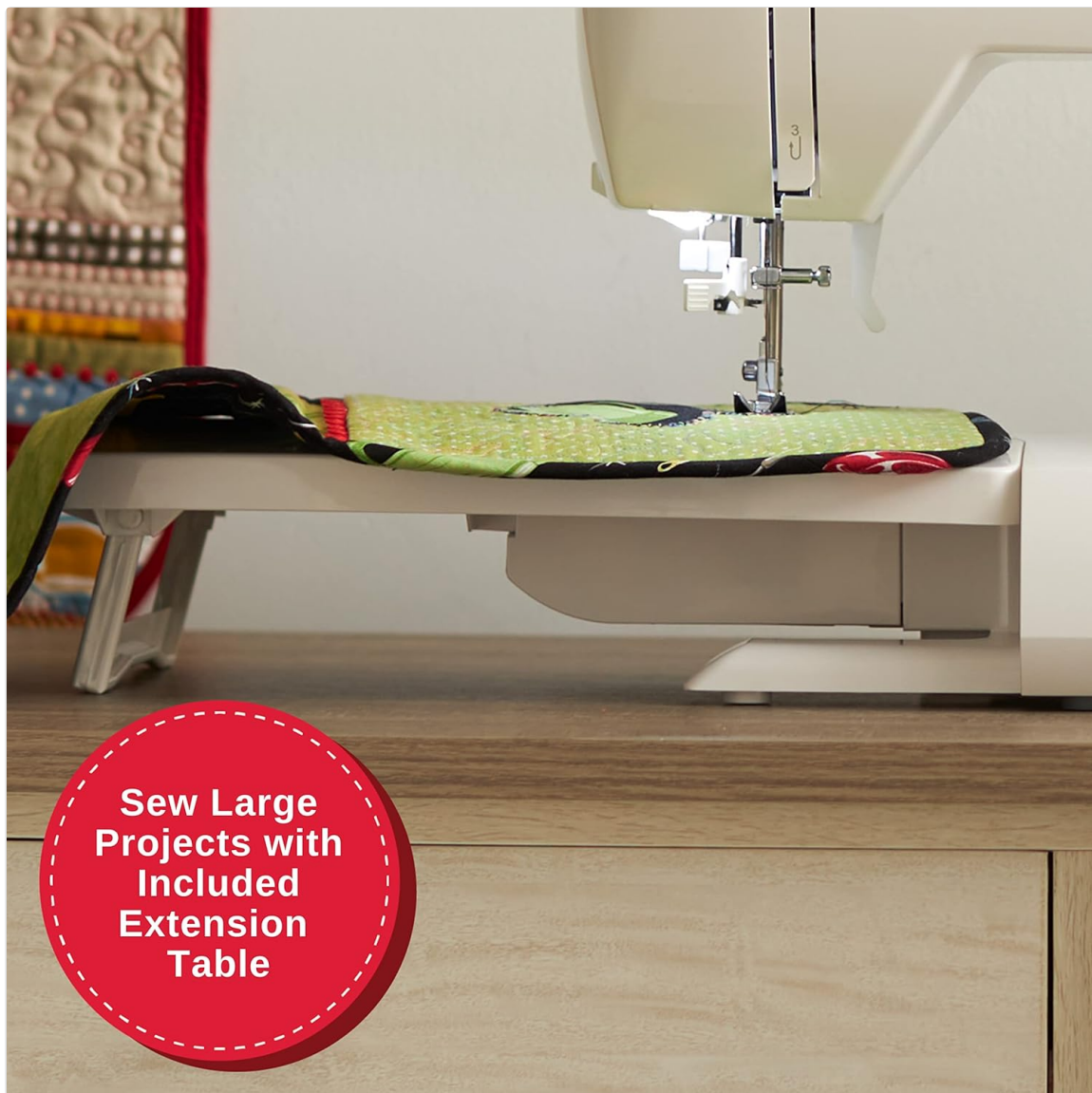
Image: The SINGER 5560 machine with its extension table in place, facilitating the sewing of large projects.