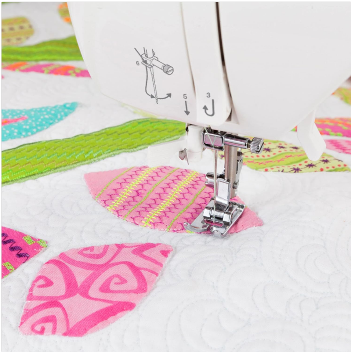
Image: The SINGER 5560 machine actively sewing on a piece of quilted fabric, demonstrating its operational capability.