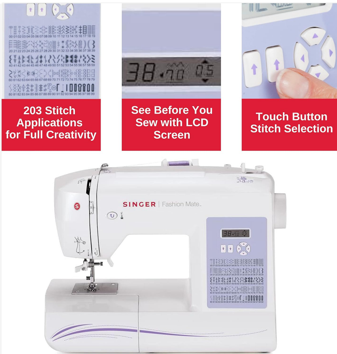
Image: The LCD screen and touch buttons for stitch selection, showing stitch number, width, and length. A visual guide to 203 stitch applications is printed on the machine's front panel.