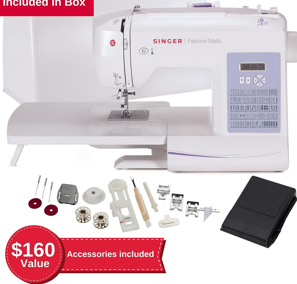
Image: SINGER 5560 Computerized Sewing Machine with its comprehensive accessory kit, including various presser feet, bobbins, needles, and an extension table.