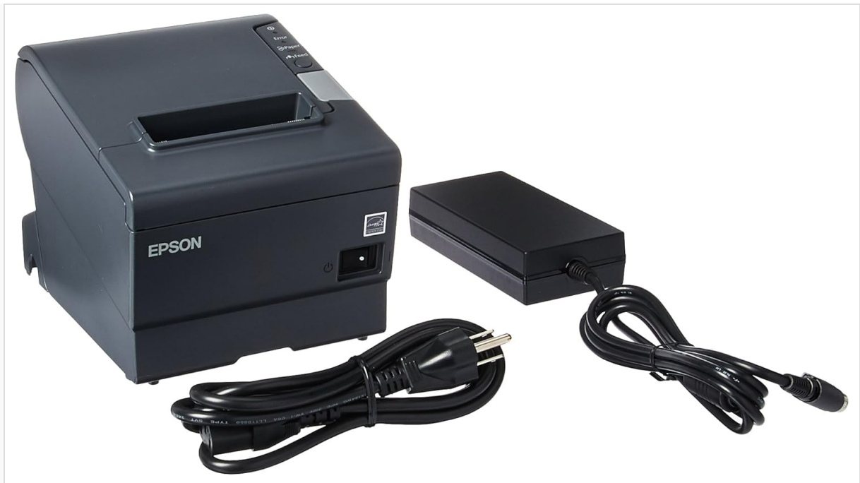
Image: Epson TM-T88V printer, power supply, and connecting cables. The printer is dark grey with the Epson logo on the front. The power supply is a black rectangular unit, and two black cables are coiled in the foreground.

Note: Communication cables (USB or Serial) are typically sold separately and are not included in the standard package.