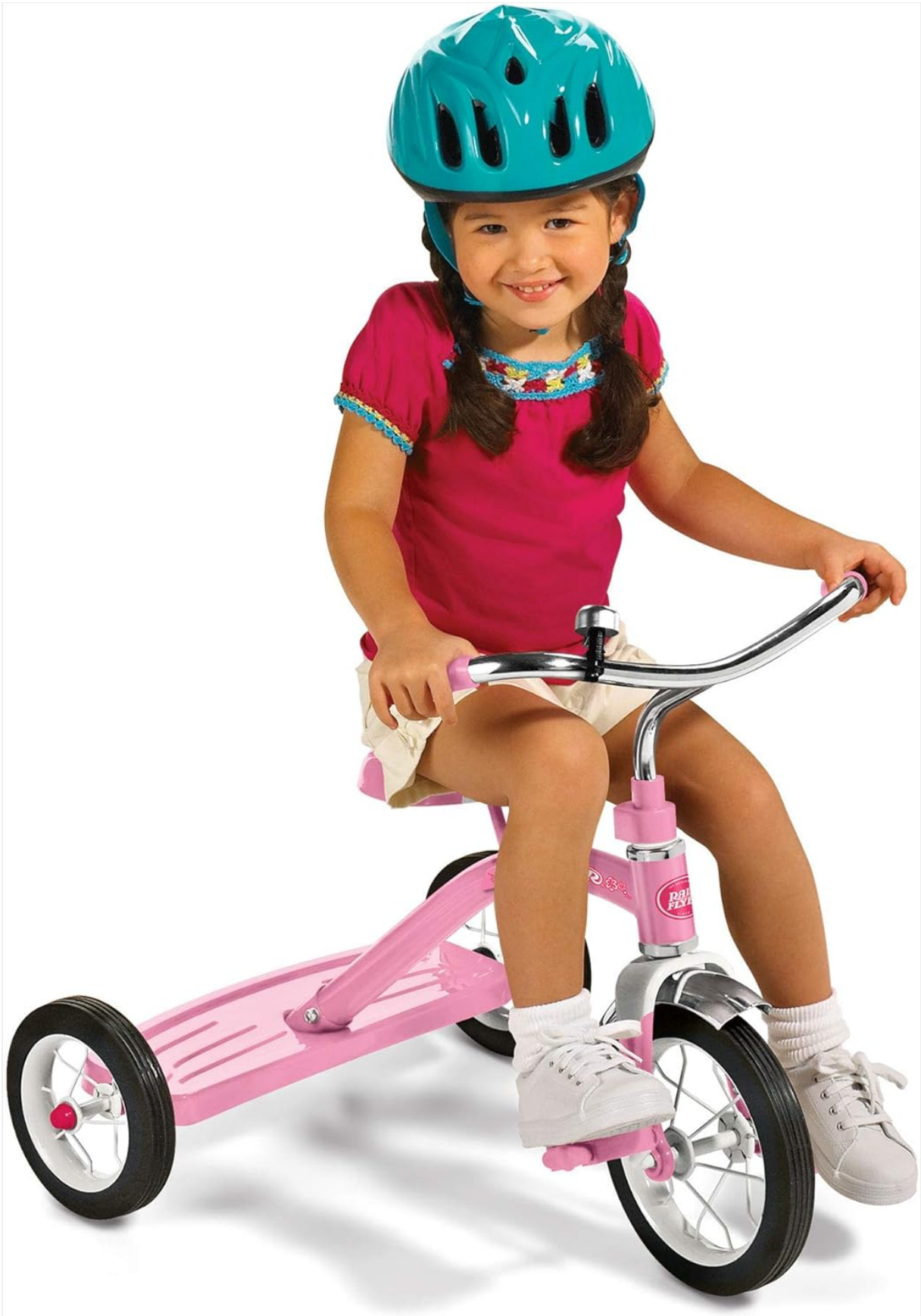
Image: A child confidently riding the Radio Flyer Classic Pink Tricycle, demonstrating proper posture and use.