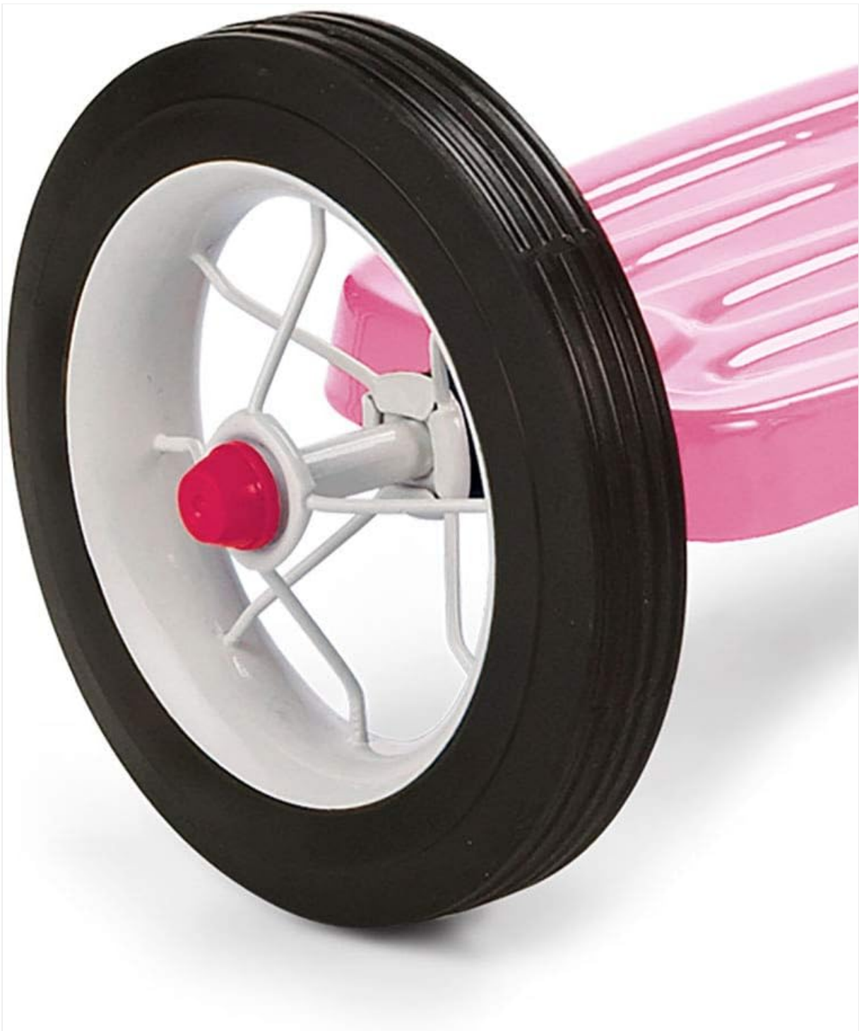
Image: A detailed view of the rear wheel and durable rubber tire, highlighting components to inspect during maintenance.