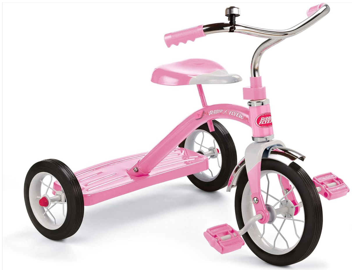
Image: The Radio Flyer Classic Pink 10-inch Tricycle, showcasing its classic design and pink finish.

The Radio Flyer Classic Pink 10-inch Tricycle is designed for young riders, offering a durable and enjoyable experience. This manual provides essential information for the proper assembly, safe operation, and routine maintenance of your tricycle.