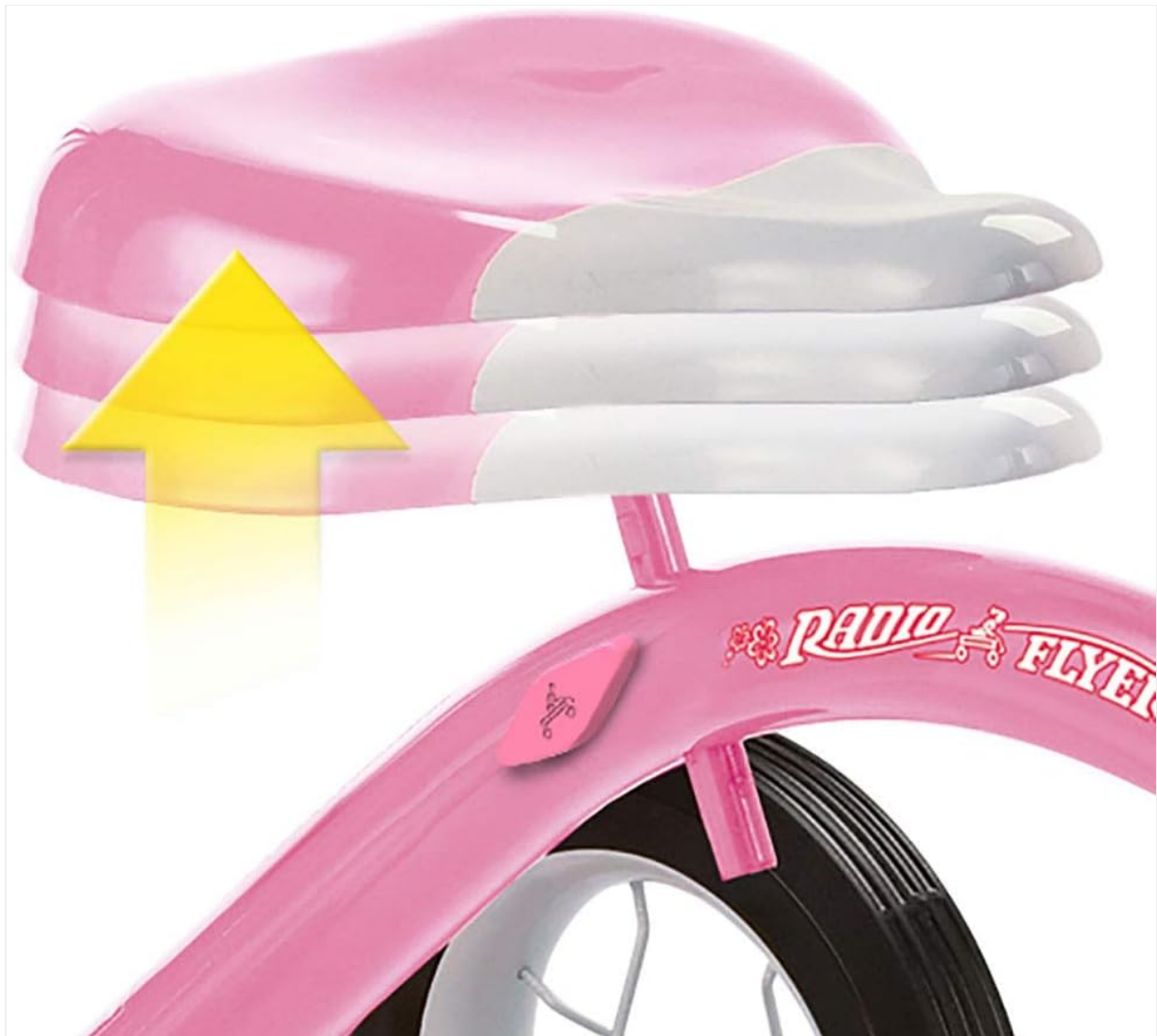
Image: A close-up view of the adjustable seat feature, showing how the seat can be moved to accommodate a growing child.