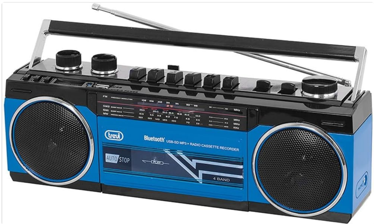
Figure 1: Front view of the Trevi RR 501 BT boombox, showing the two speakers, control panel with buttons and knobs, cassette deck, and telescopic antenna.