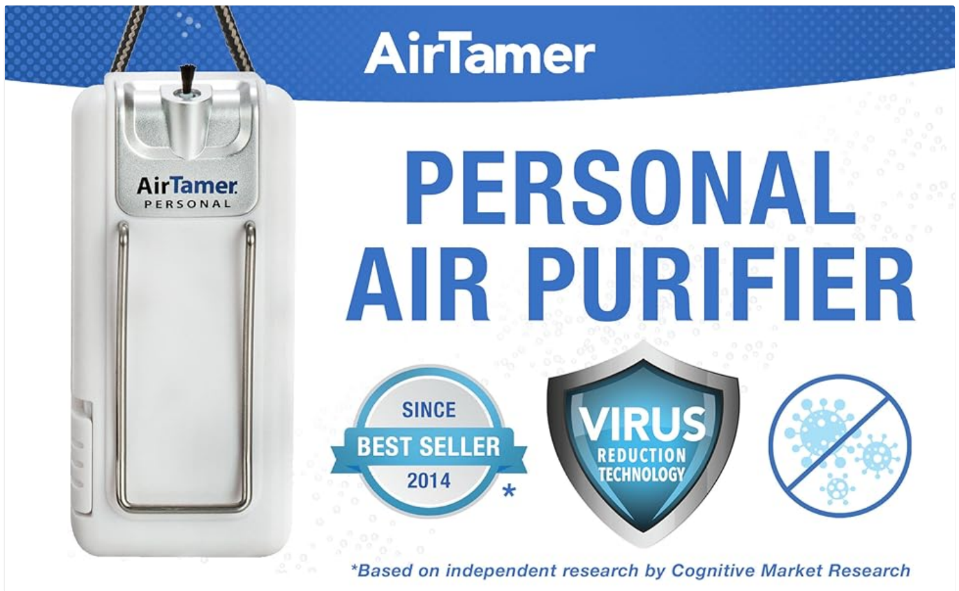
Figure 8: AirTamer A302 for use in various public and private settings.