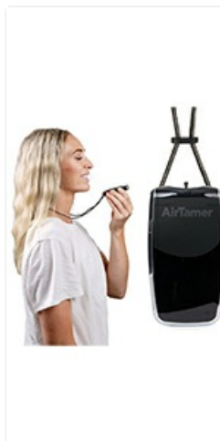
Figure 1: Metal travel case for the AirTamer A302.