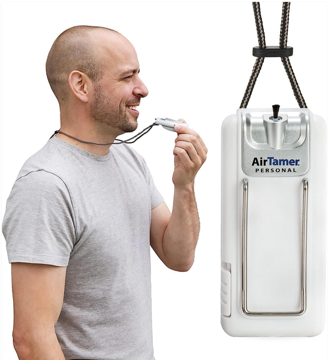
Figure 6: Man using the AirTamer A302.