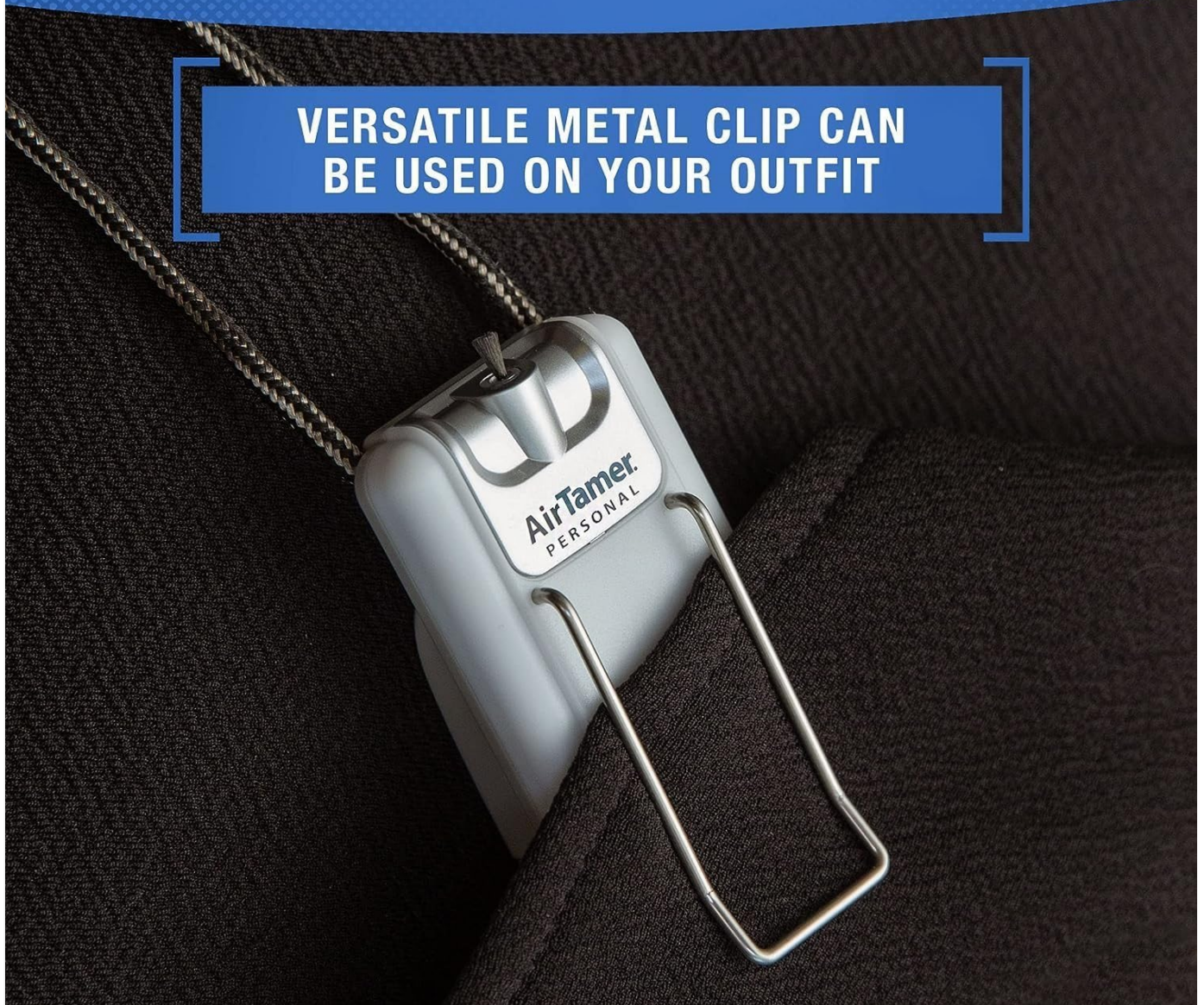
Figure 7: AirTamer A302 clipped to clothing.

VERSATILE METAL CLIP CAN BE USED ON YOUR OUTFIT