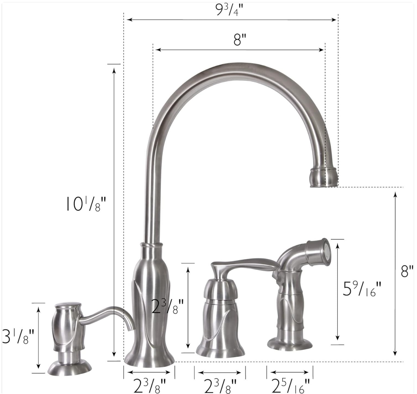
Dimensional drawing of the faucet, handle, side sprayer, and soap dispenser, providing key measurements for installation planning.