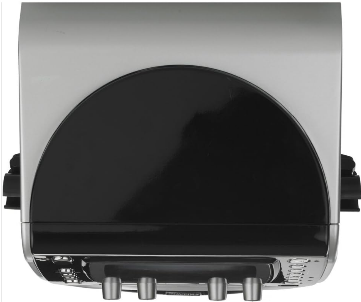
Image: Top view of the Singing Machine STVG-519 CDG Karaoke Player, highlighting the various control knobs for microphone volume, key, balance, and echo.