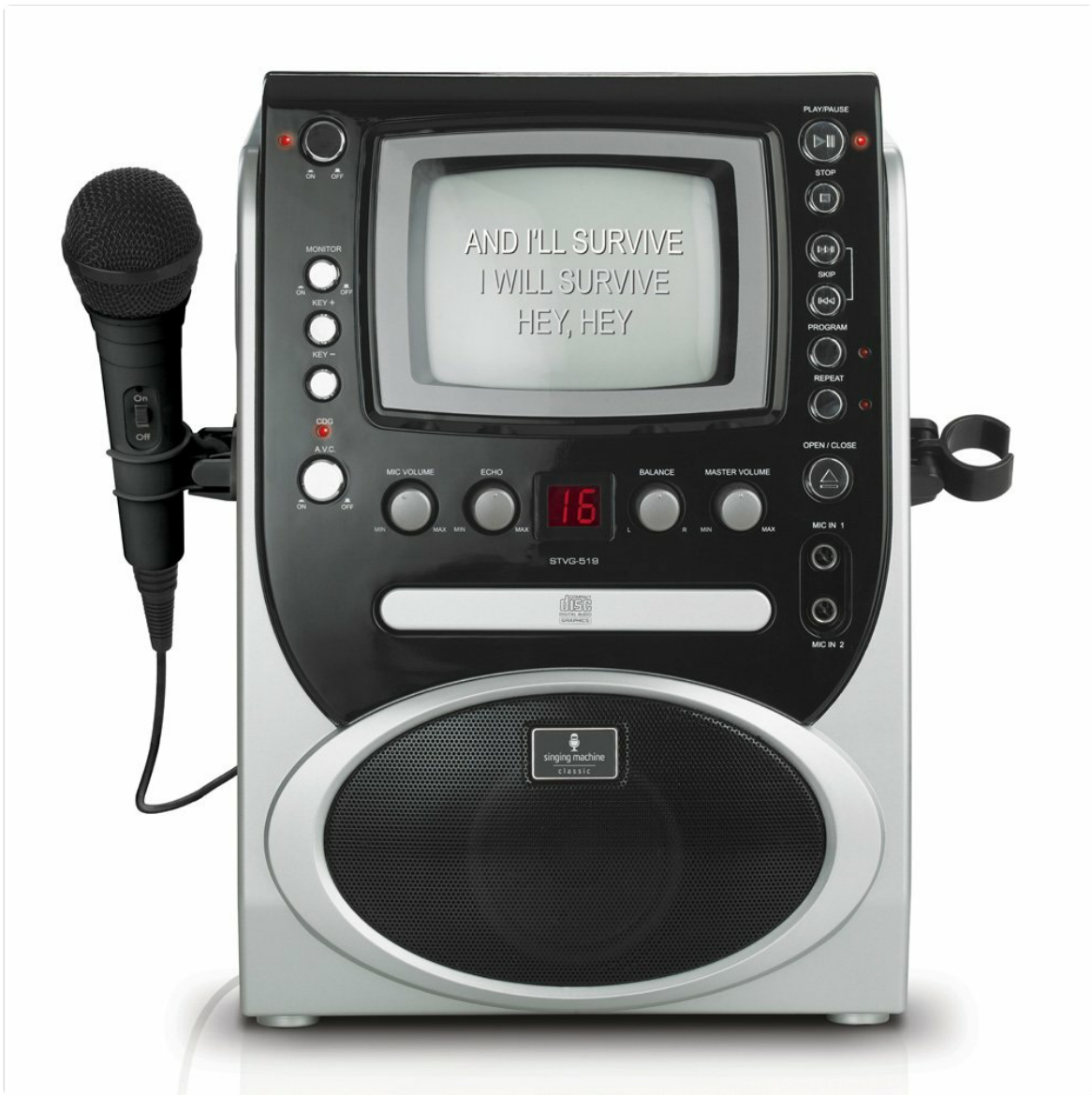
Image: Front view of the Singing Machine STVG-519 CDG Karaoke Player, showing the 5.5-inch black and white monitor, control panel, speaker, and a connected microphone.