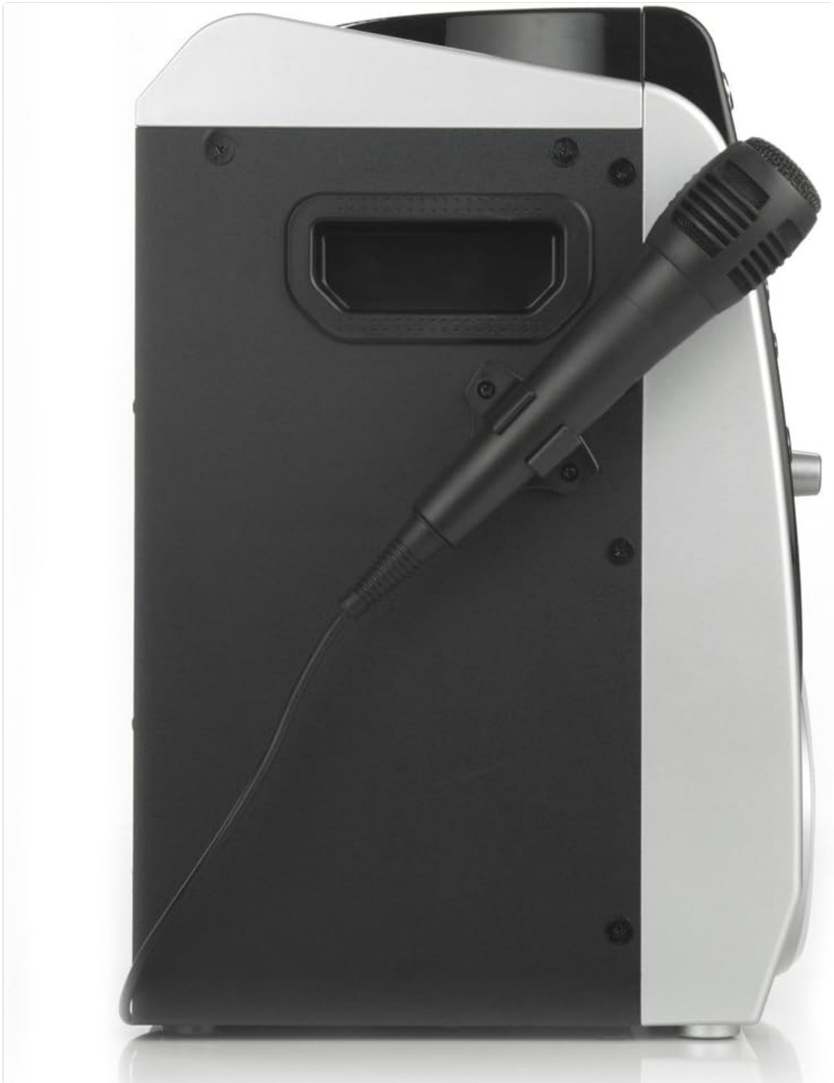
Image: Side view of the Singing Machine STVG-519 CDG Karaoke Player, showing the integrated microphone holder for convenient storage.