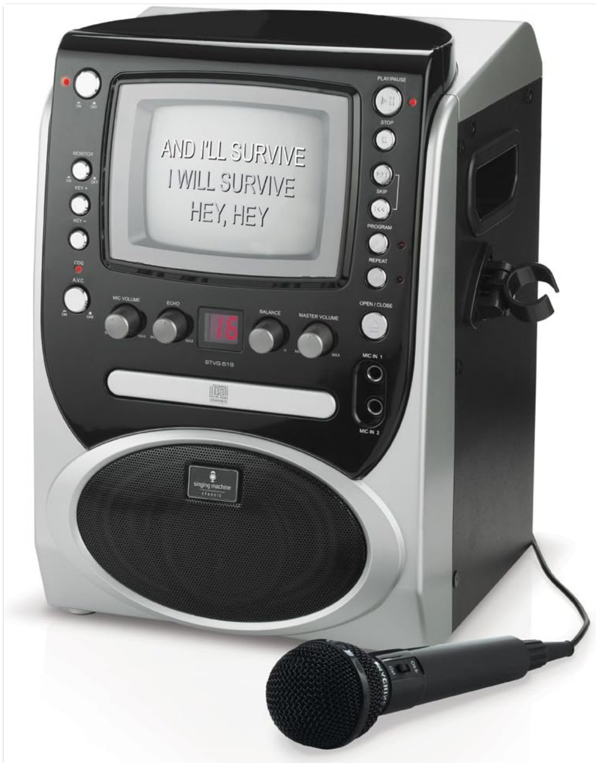
Image: Close-up front view of the Singing Machine STVG-519 CDG Karaoke Player, showing the 5.5-inch black and white screen displaying song lyrics.