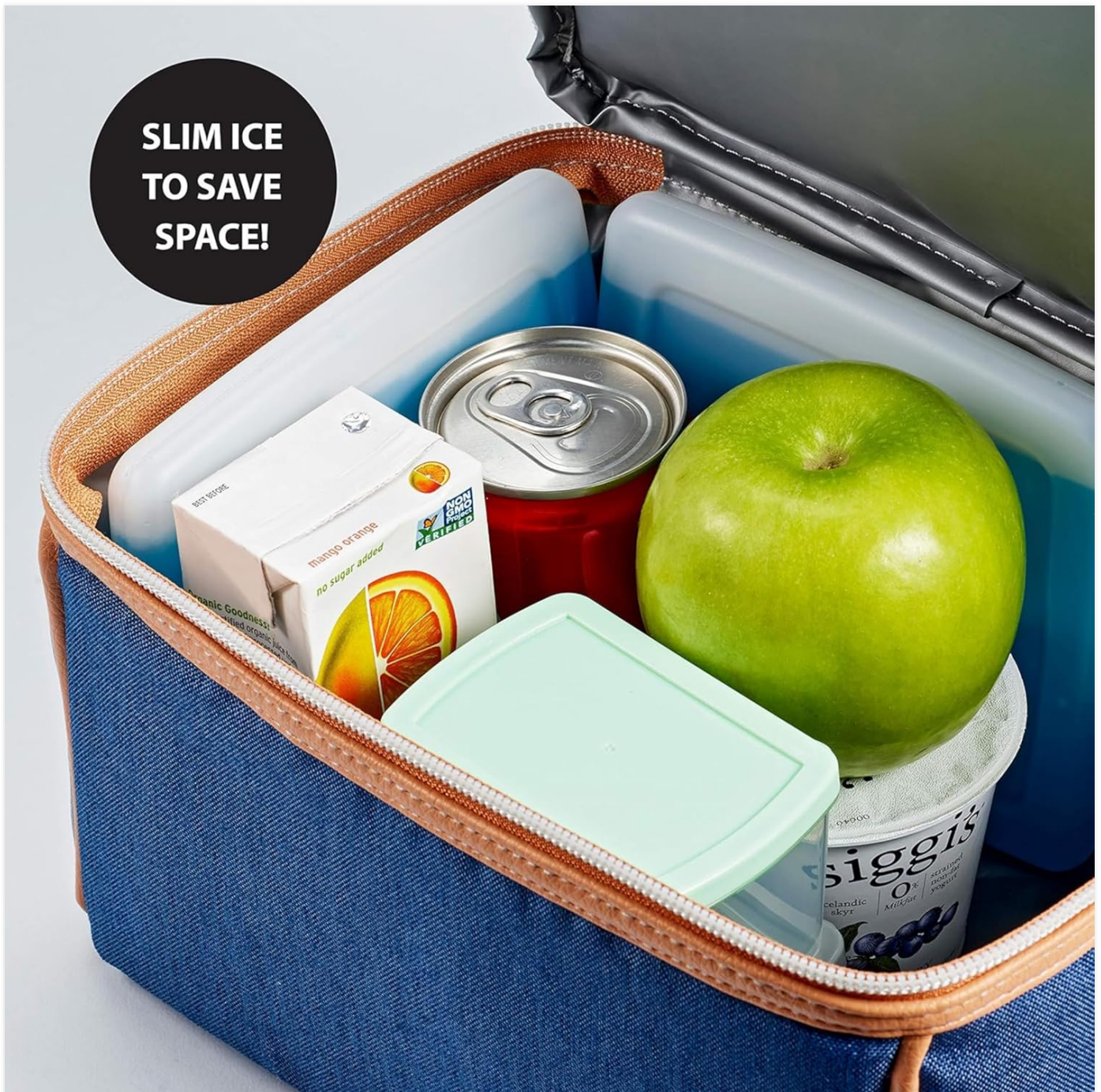
Image: Ice packs in a lunch bag with various food items.