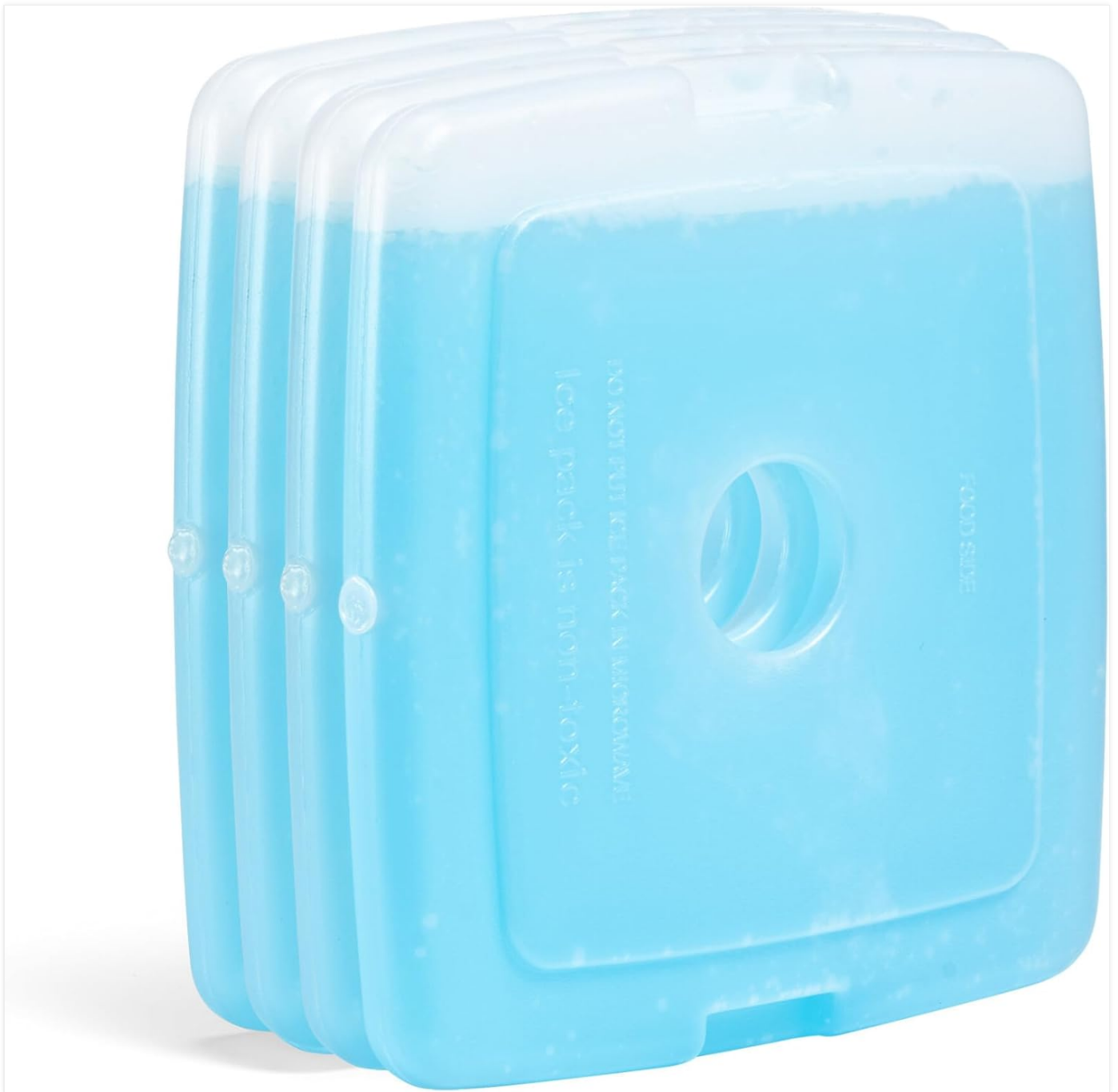
Image: Rear view of Cool Coolers Slim Ice Packs.