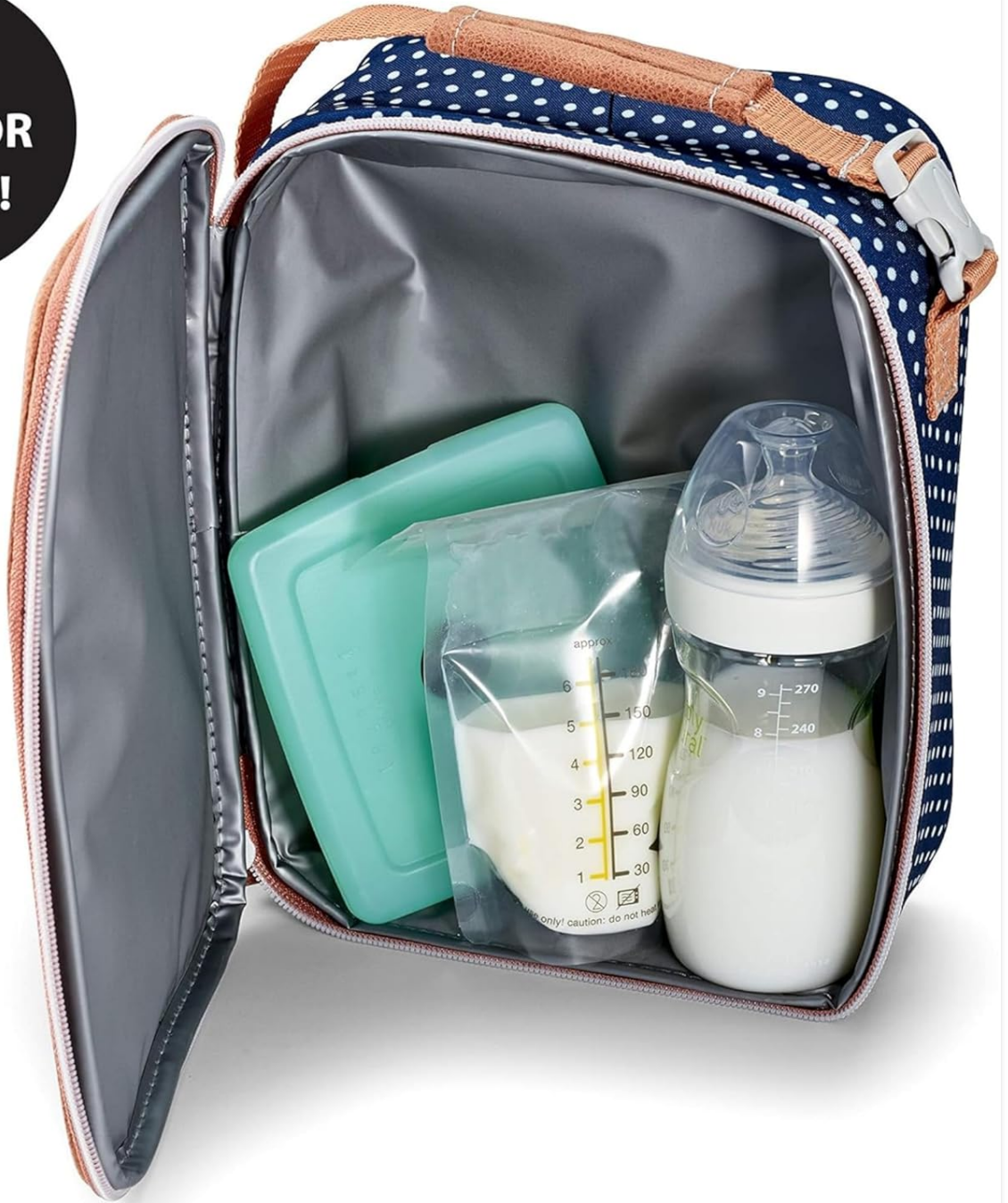
Image: Ice packs inside a lunch bag with baby items.