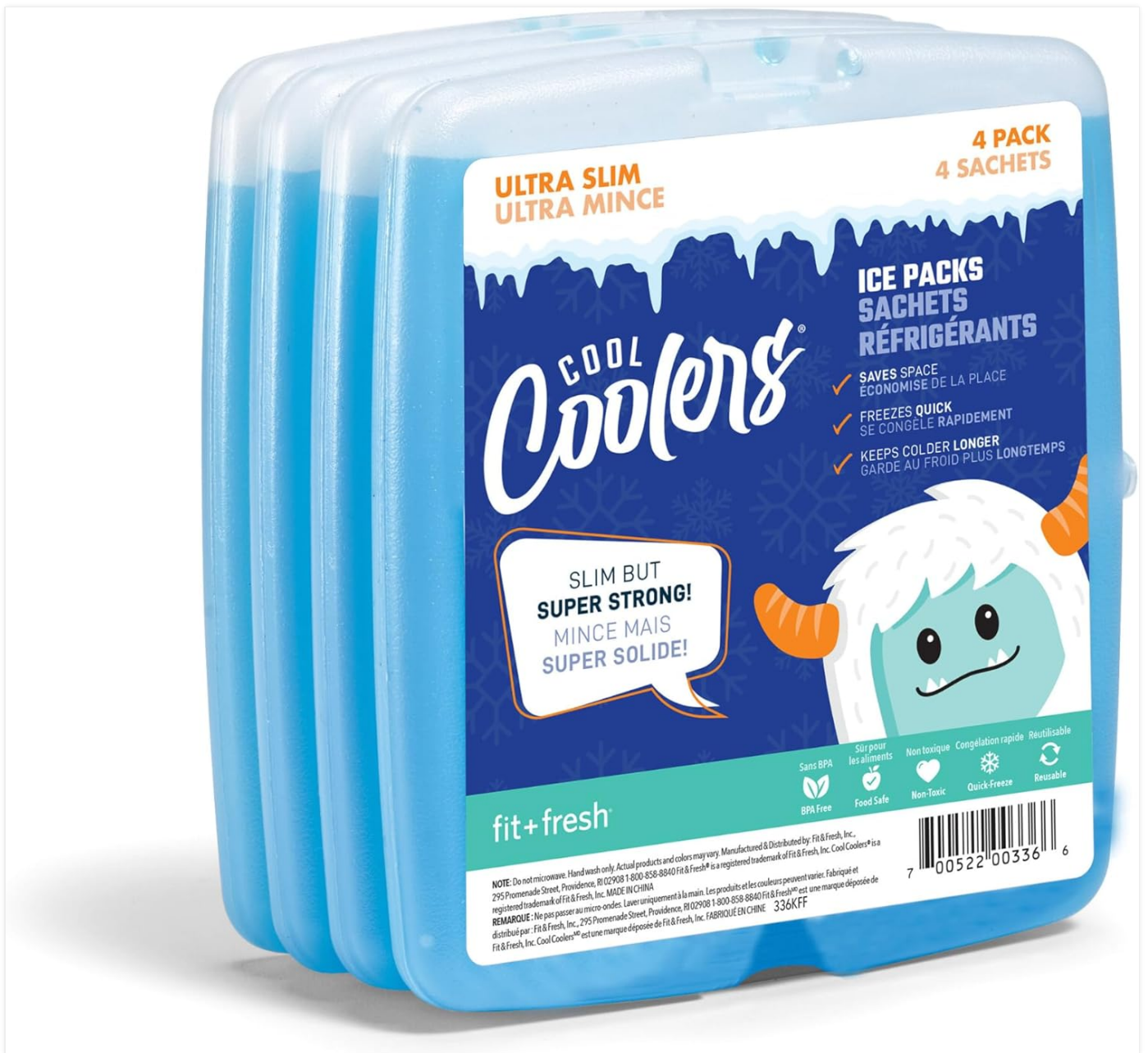
Image: Four Cool Coolers Slim Ice Packs in their packaging.