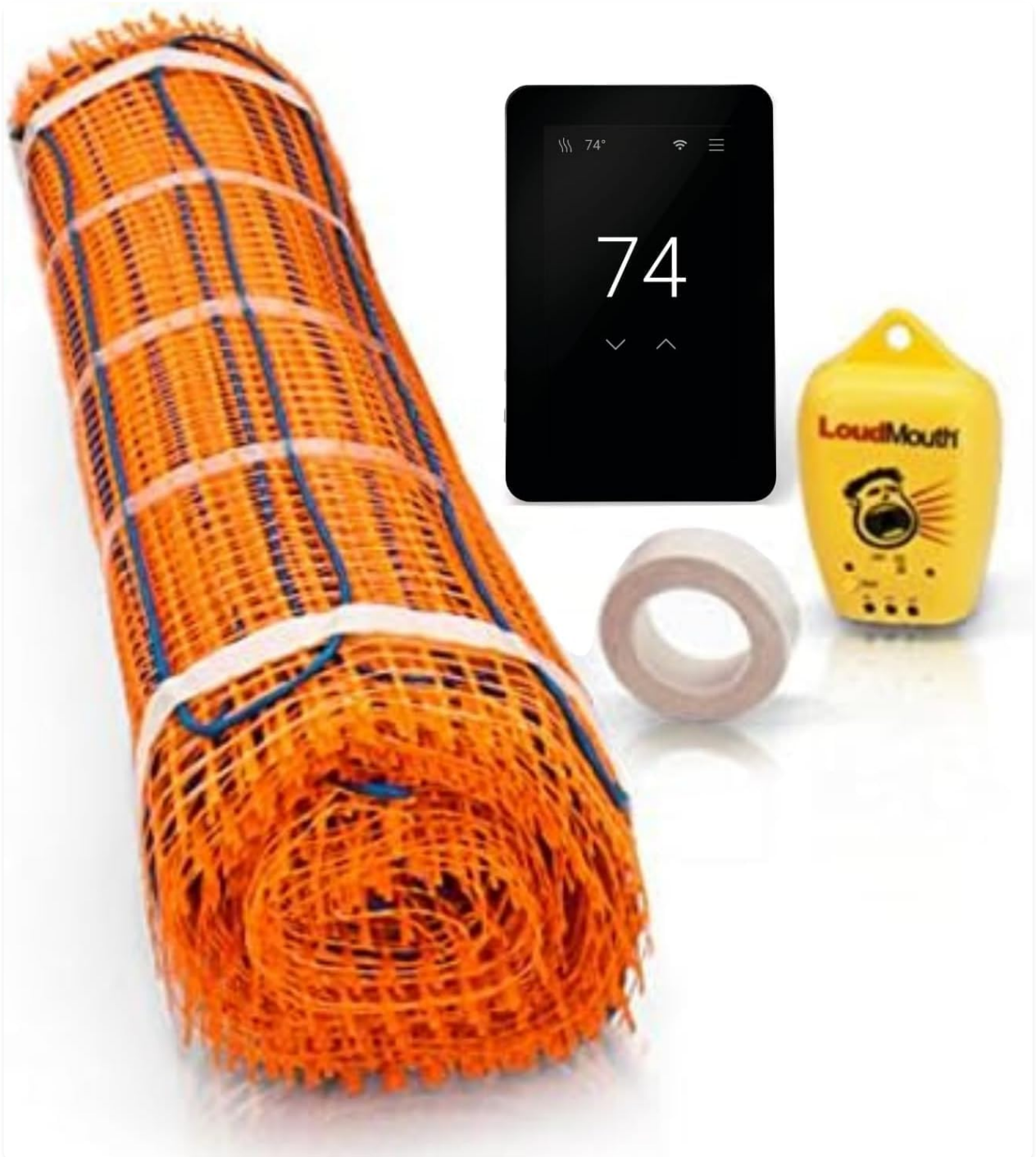
Figure 1: Main components of the SunTouch TapeMat Electric Floor Heating Kit, including the rolled mat, Command Touch thermostat, LoudMouth monitor, and double-sided tape.