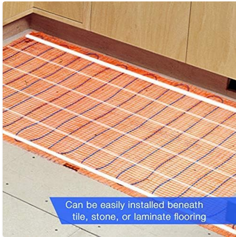
Figure 5: An illustration showing the SunTouch TapeMat installed beneath finished tile flooring, highlighting its discreet integration.

Your browser does not support the video tag.