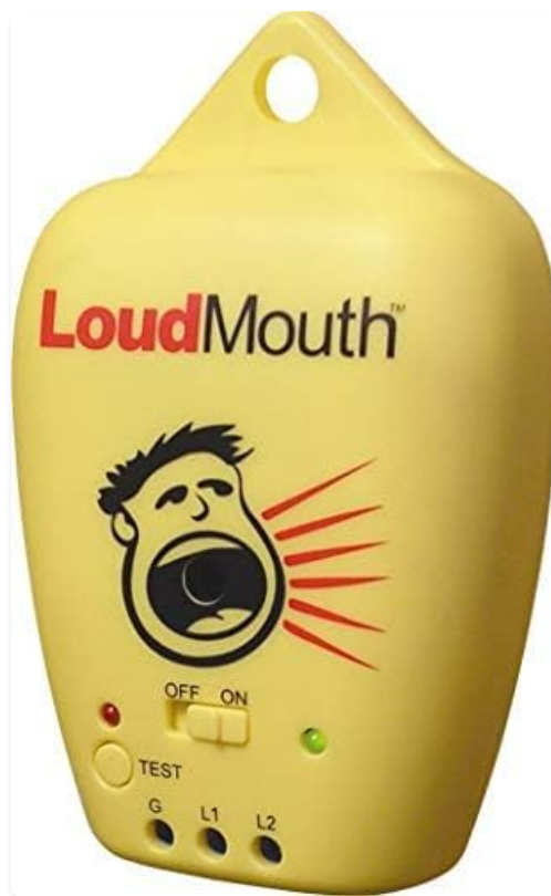
Figure 4: The yellow LoudMouth installation monitor, showing its on/off switch, test button, and indicator lights for monitoring the heating cable during installation.