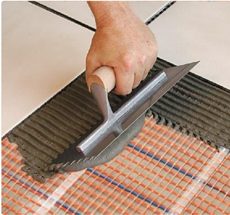
Figure 3: A hand using a trowel to apply thin-set mortar over the installed SunTouch TapeMat, embedding the heating cables.