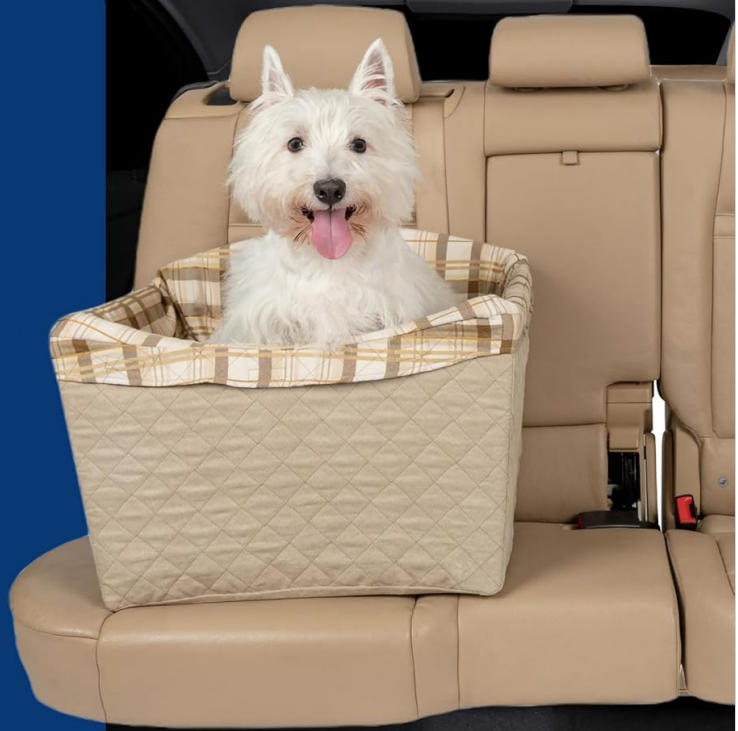
Figure 3: The booster seat provides a comfy space for adventures, fitting most vehicles.