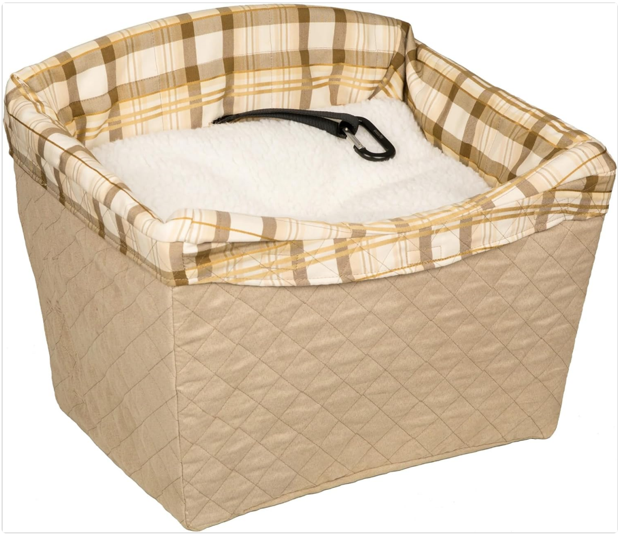
Figure 5: The removable quilted liner and cushion facilitate easy cleaning.