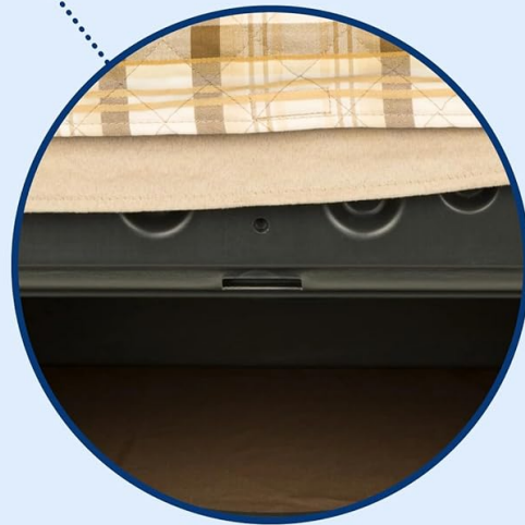
Figure 4: The 9-inch raised platform allows pets to see out the window, enhancing comfort.

Designed to protect your back seat from pet hair and scratches