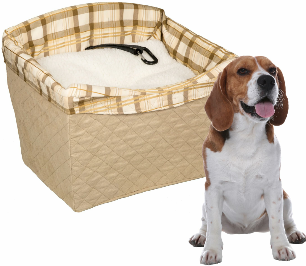
Figure 1: Dog comfortably seated in the PetSafe Happy Ride Quilted Dog Safety Seat.