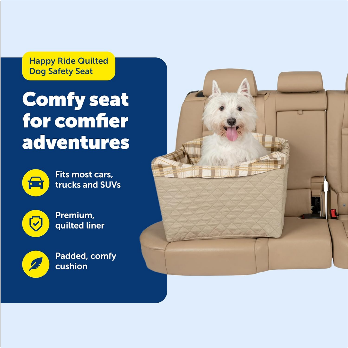
Figure 6: Key dimensions and safety features of the booster seat.