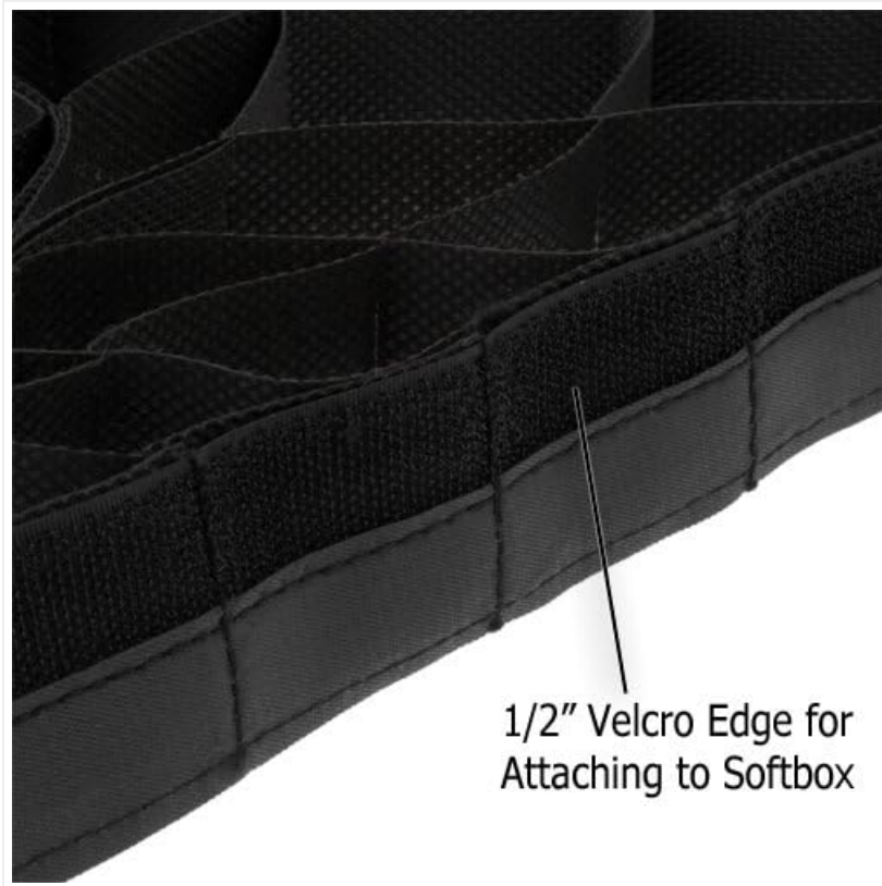
Figure 2: Detail of the Velcro edge for secure attachment to a softbox.