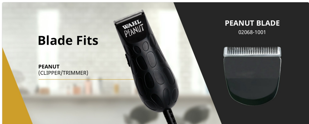
Image: Wahl Professional Peanut/Bullet Blade, Model 02068-1001, highlighting blade geometry, skin safety, and quick-detach feature.

The Wahl Professional Standard Snap-On Blade is designed for precise and efficient trimming. This replacement blade ensures sharp performance and is engineered for easy maintenance and quick changes, providing a smooth and comfortable trimming experience across all hair types.